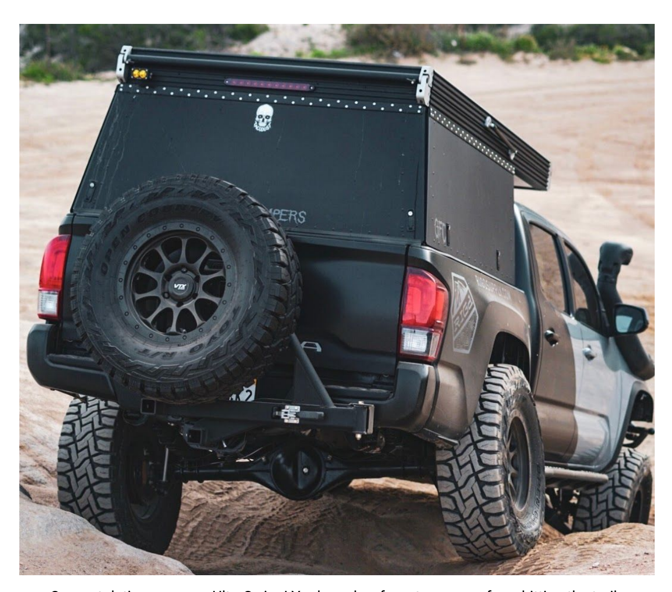
Congratulations on your UltraSwing! You're only a few steps away from hitting the trail.