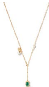
VICTORIA € 155