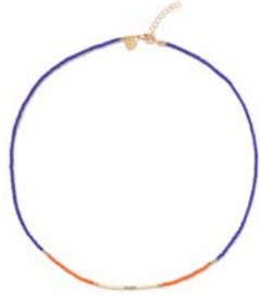
HAILEY € 110