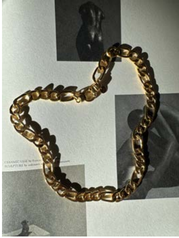
DELLA € 295