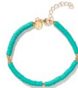
HANNAH B € 65