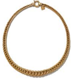
AVA (BRASS) € 240