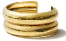
HARLEY GP € 275 BRASS € 140