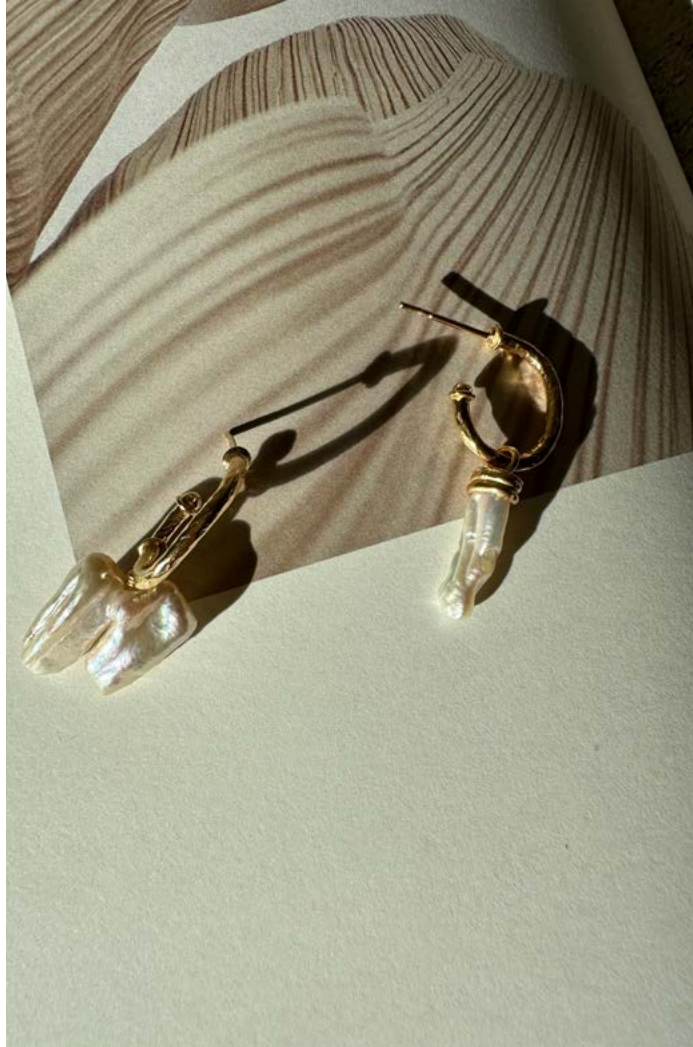
ROWAN € 145 BLAKE € 140