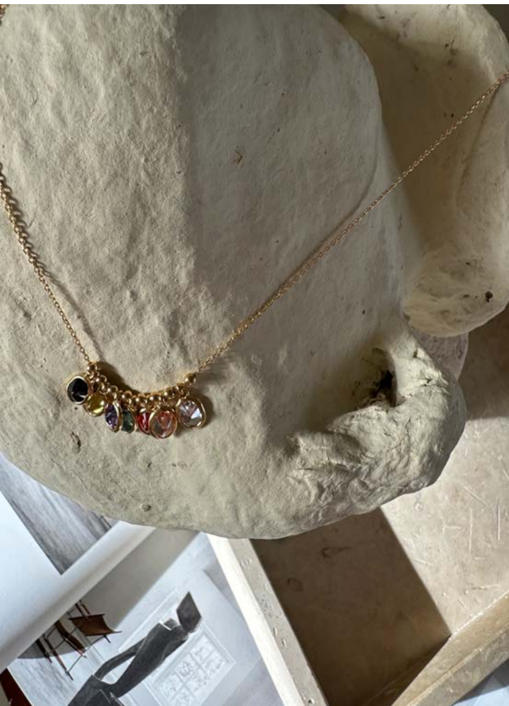
MYLAH € 155