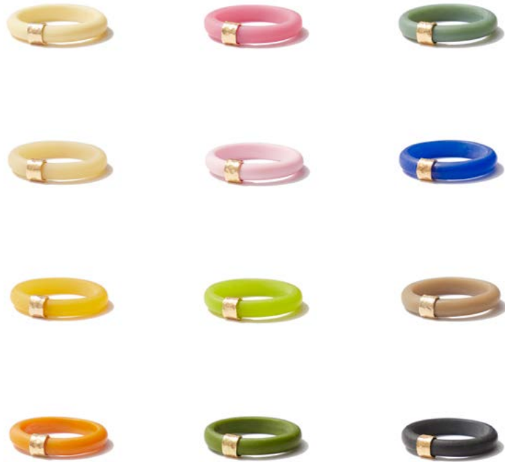
SKYLAR € 65