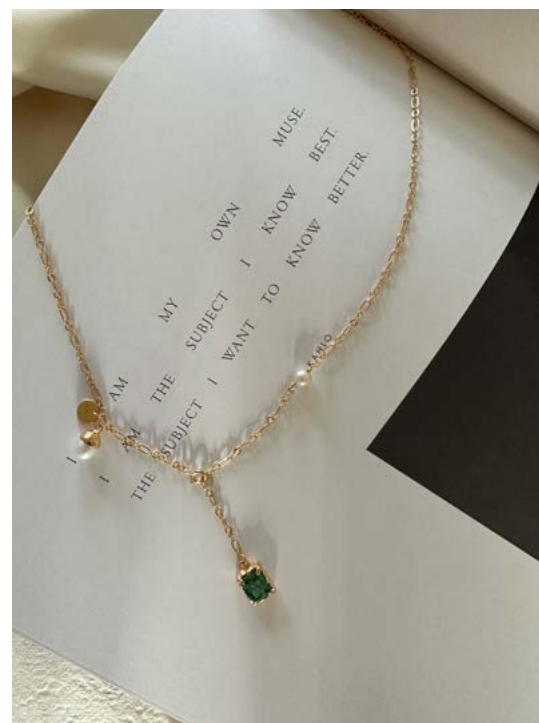
VICTORIA € 155