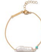
HALLIE € 135