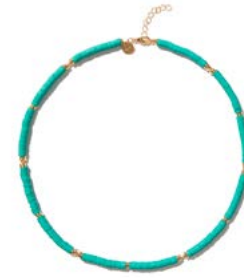
HANNAH N € 110