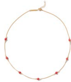
RILEY € 135