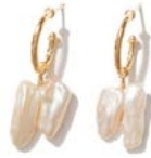
ROWAN € 145