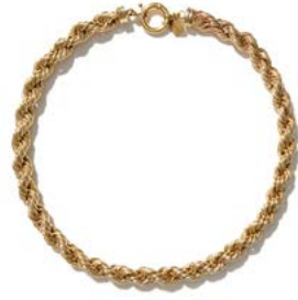
COLETTE (BRASS) € 270