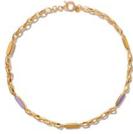
HARPER € 380