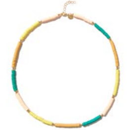
LEAH N € 90