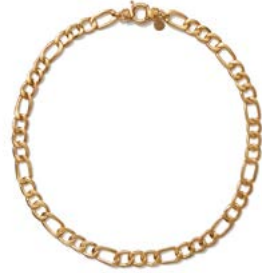
DELLA € 295