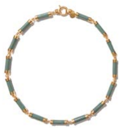
CLOVER GREEN € 230