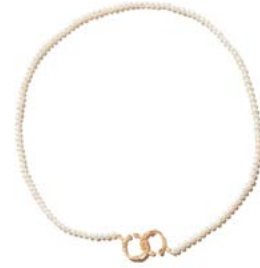
MABEL € 185