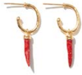
KNOX € 130