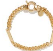
WILLOW € 180