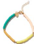
LEAH B € 65