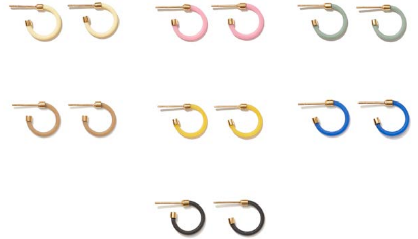
STEVIE € 80