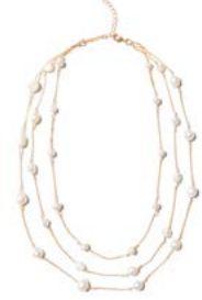
JACKIE € 290