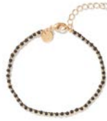
MAYA B € 65