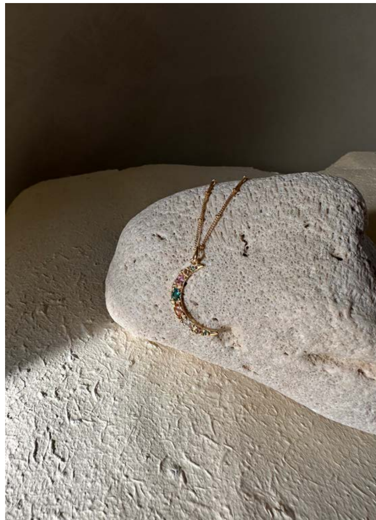
SKYE € 145