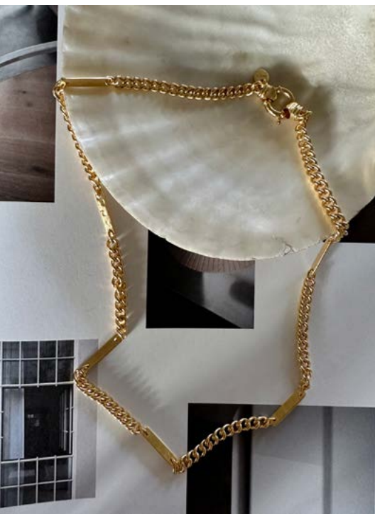
WILLOW € 275