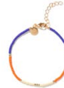
HAILEY B € 65