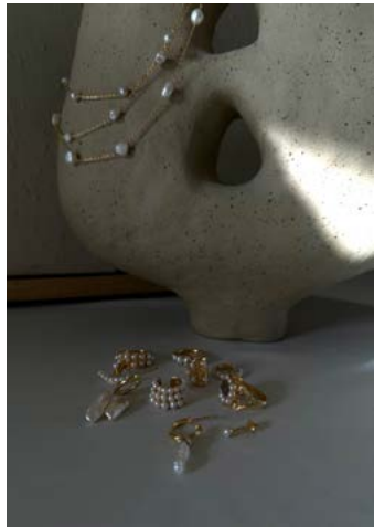
MIMI ET TOI '23 CIRQUE D'ÉTÉ