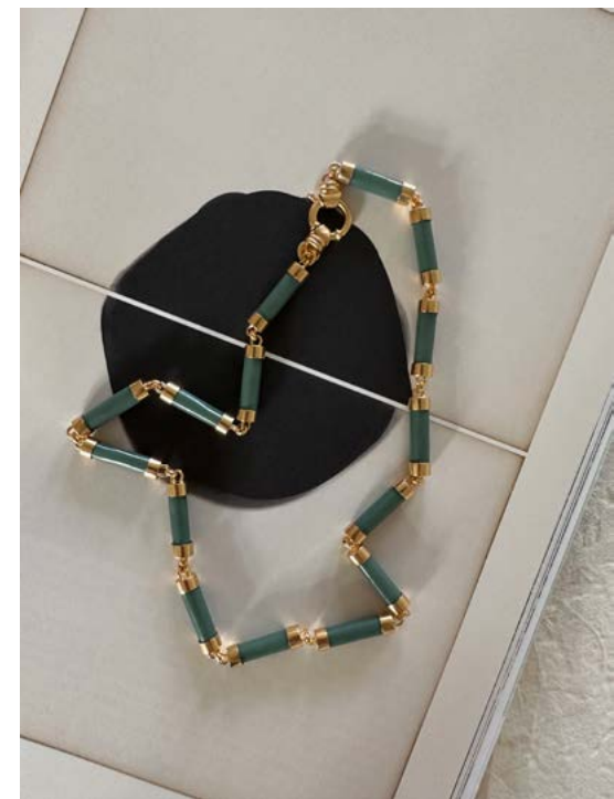
CLOVER € 230