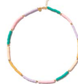
BROOKLYN N € 90