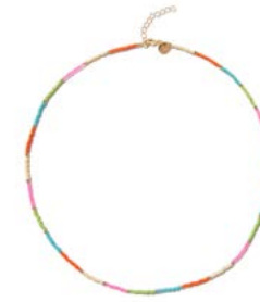
SCOTTY N € 110