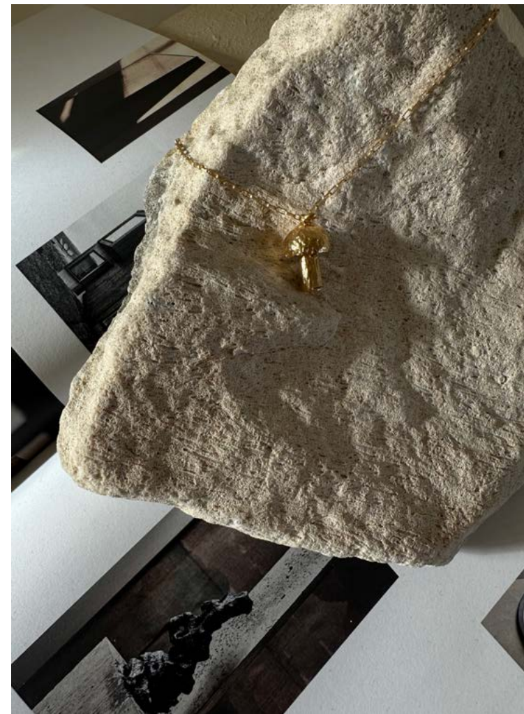
POPPY € 170