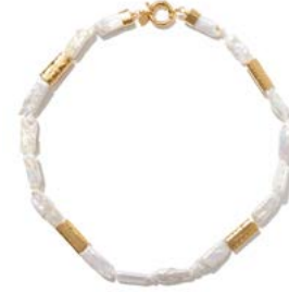
PILAR € 360