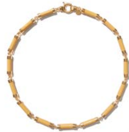
CLOVER YELLOW € 230