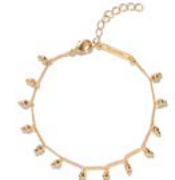
DEMI € 110