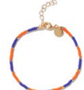
AUBREY B € 65