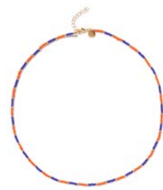
AUBREY N € 110