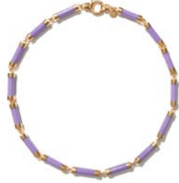
CLOVER LILAC € 230