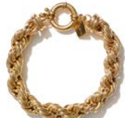
COLETTE € 190