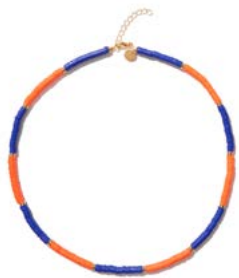
APRIL N € 110