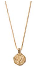
FLORA € 140