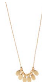
VIOLET € 130