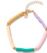
BROOKLYN B € 65