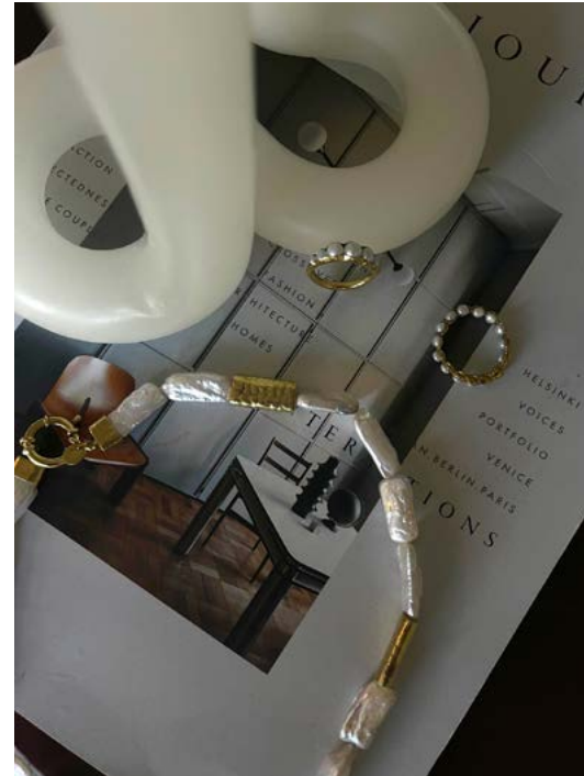
PILAR € 360 RIVER € 140