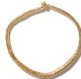
PHOENIX € 180