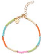
SCOTTY B € 65