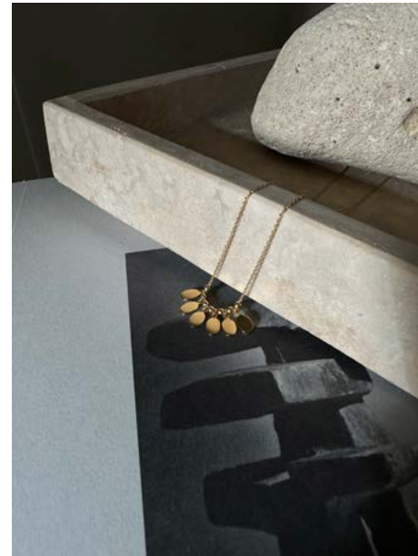
VIOLET € 130