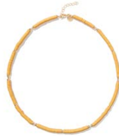
KENNEDY € 110