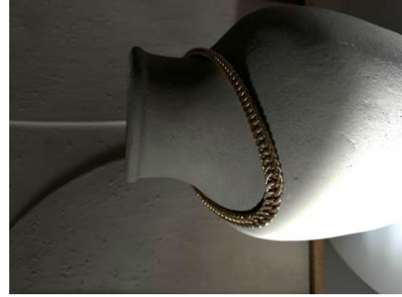
AVA BRASS € 240