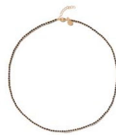
MAYA N € 130