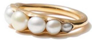
RIVER € 140