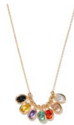
MYLAH € 155