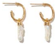
BLAKE € 140