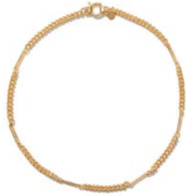
WILLOW € 275