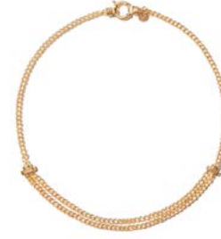
ELIA € 225