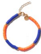
APRIL B € 65