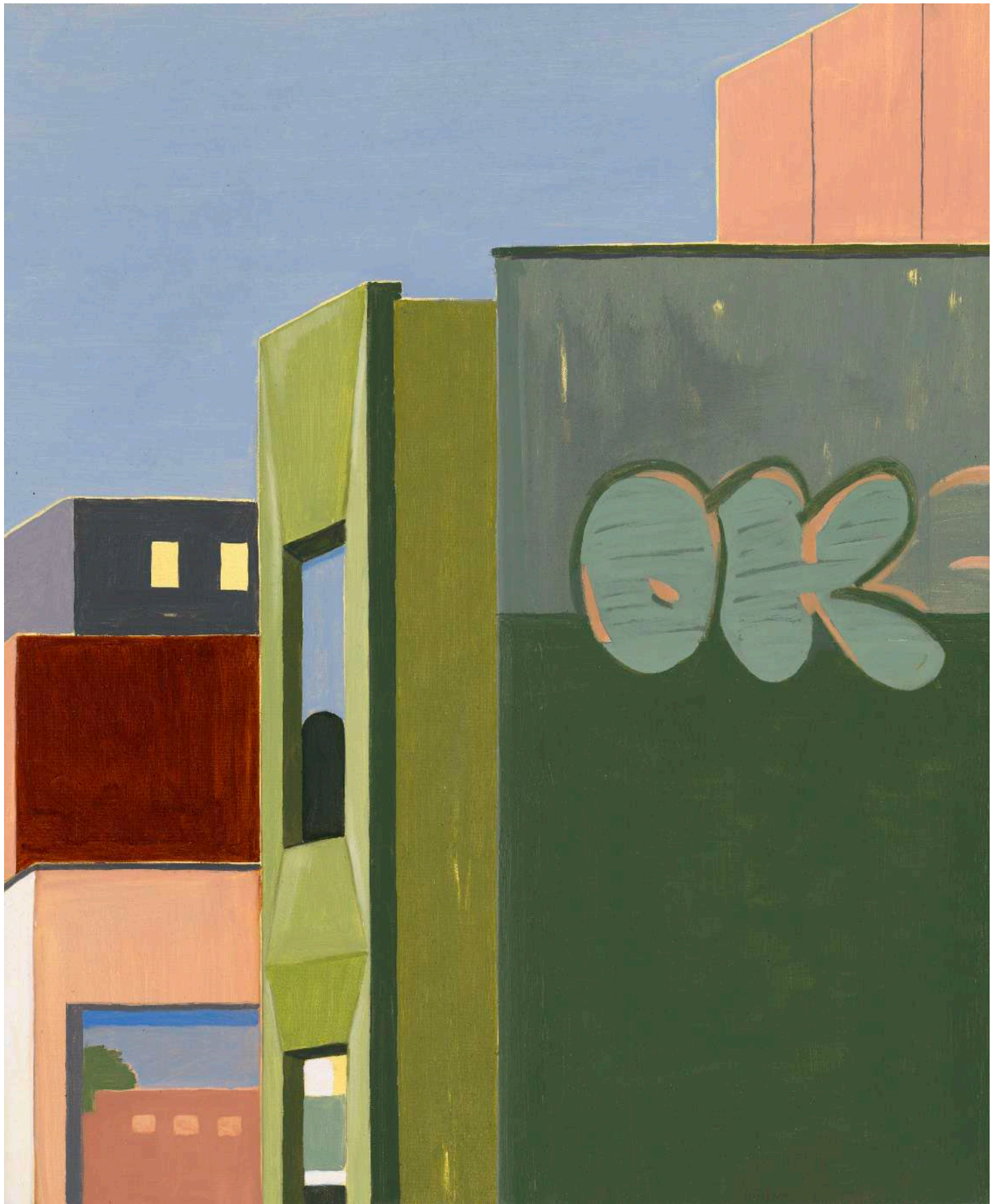
Ok Oil on Polycotton, Blackwood Frame 61 x 51 cm $2,500