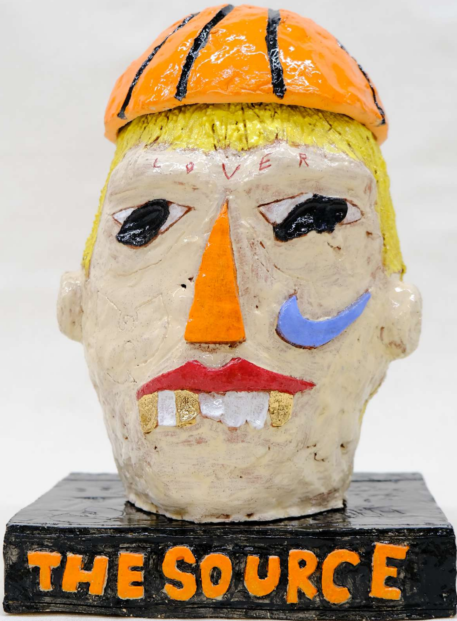
The Source Ceramic clay, glaze 30 x 30 x 20 cm $2,500