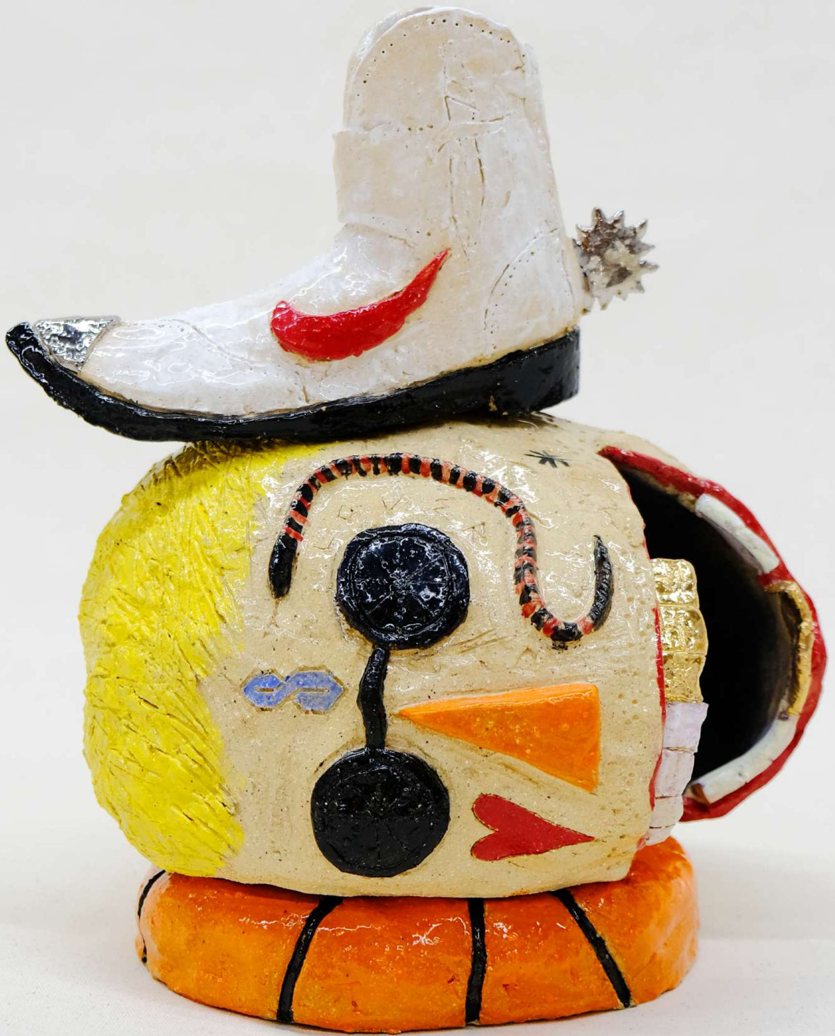
Cool Cowboy Ceramic clay, glaze 30 x 30 x 20 cm $2,500