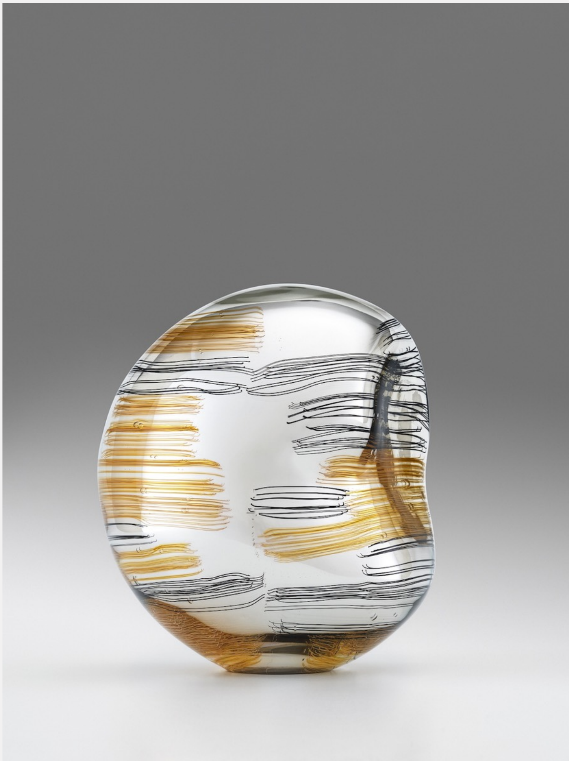
Trace No. 3 Blown and Mirrored Glass 36 x 24 x 25 cm $4,800