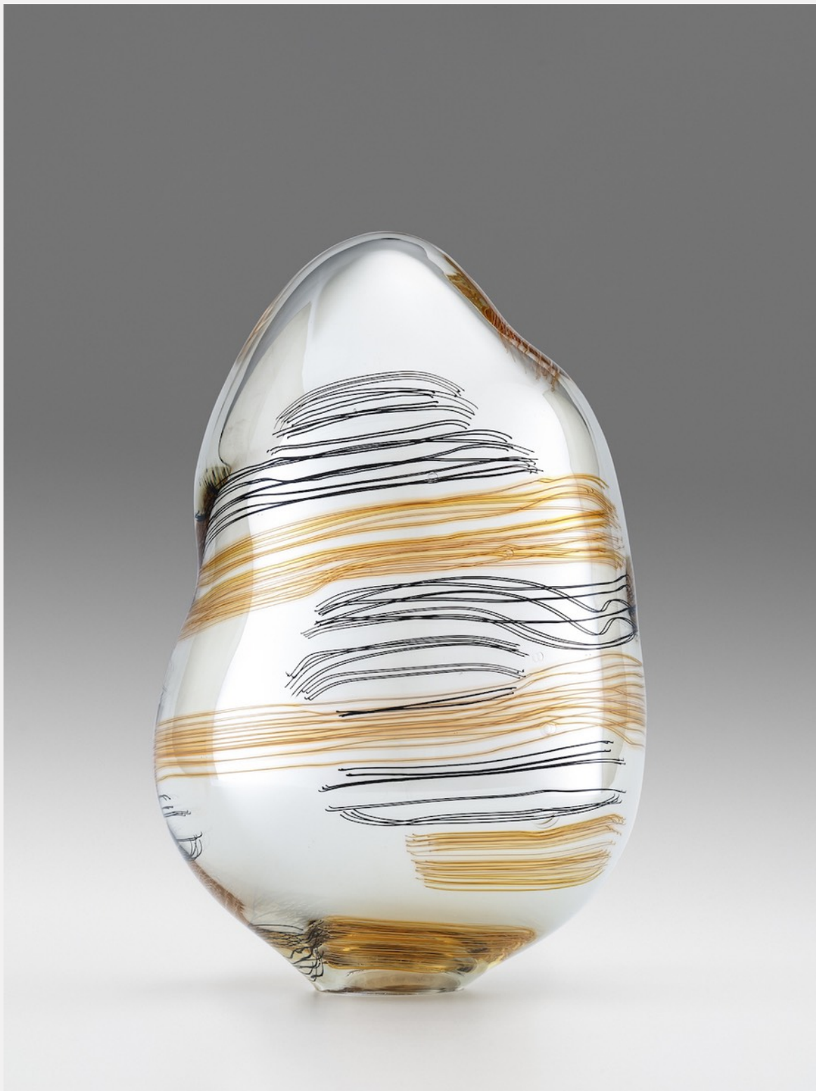
Trace No. 1 Blown and Mirrored Glass 37 x 25 x 25 cm $4,800