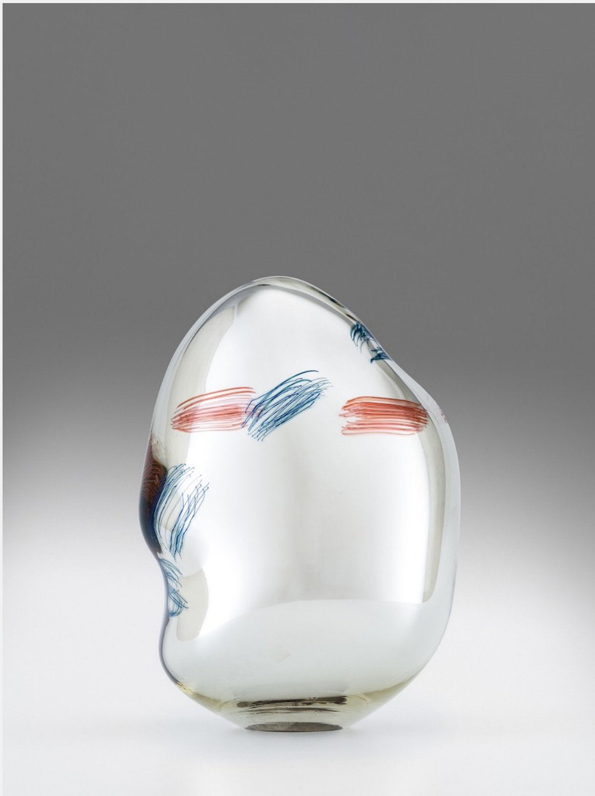
Traverse Blown and Mirrored Glass 30 x 22 x 23 cm $3,900