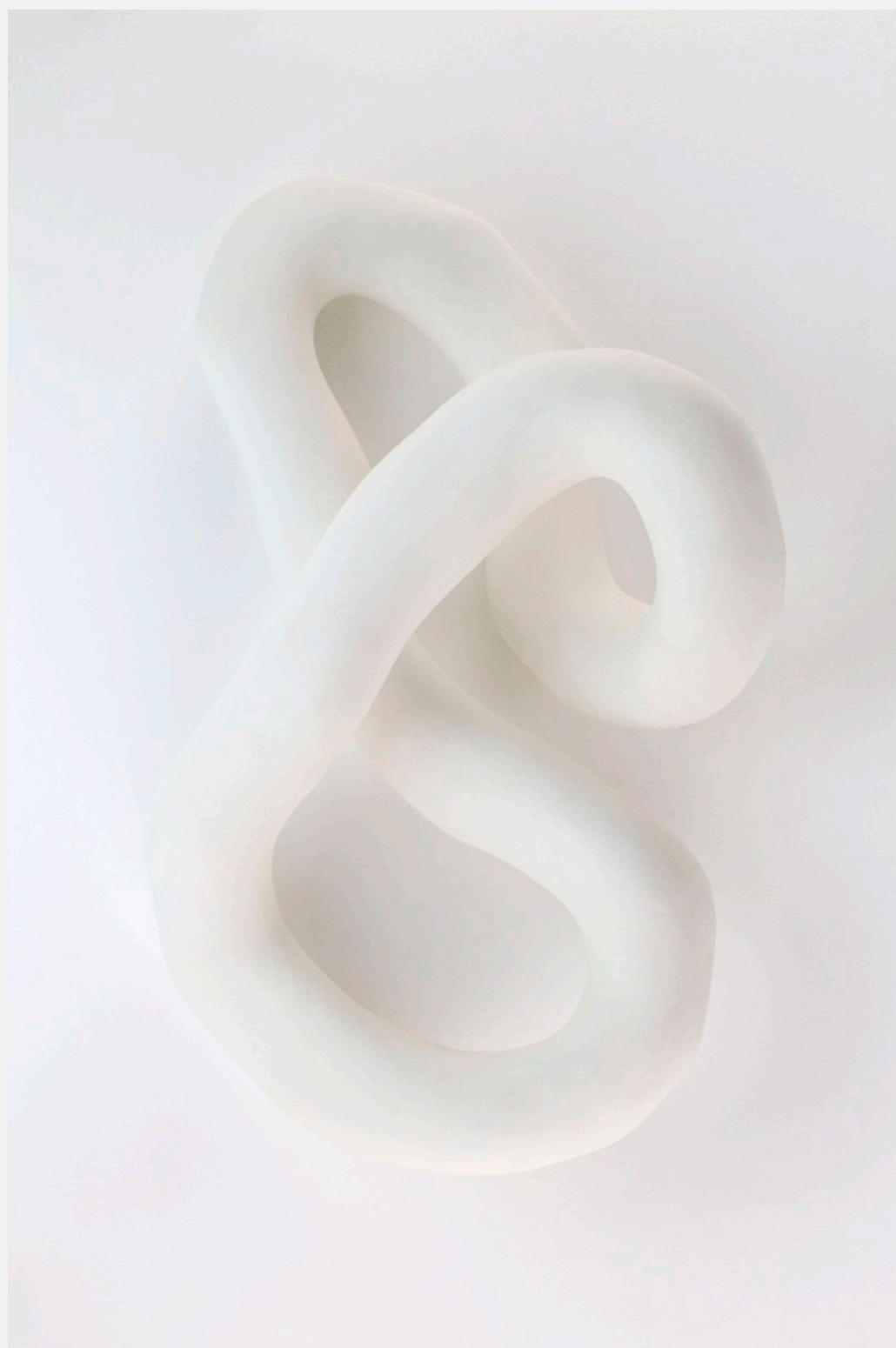
Dance of Bliss XXV Clay, Mud and Plant Extract 65 x 35 x 22 cm $3,100