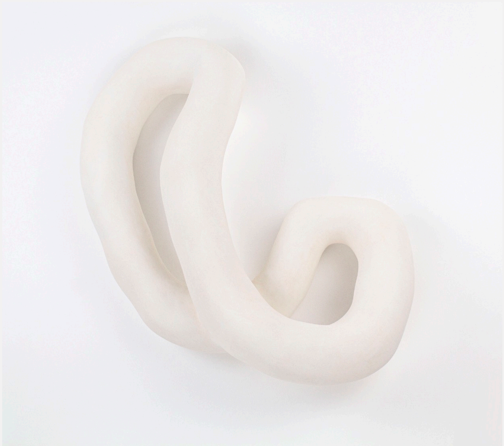
Dance of Bliss XXXXI Clay, Mud and Plant Extract 65 x 40 x 15 cm $3,100