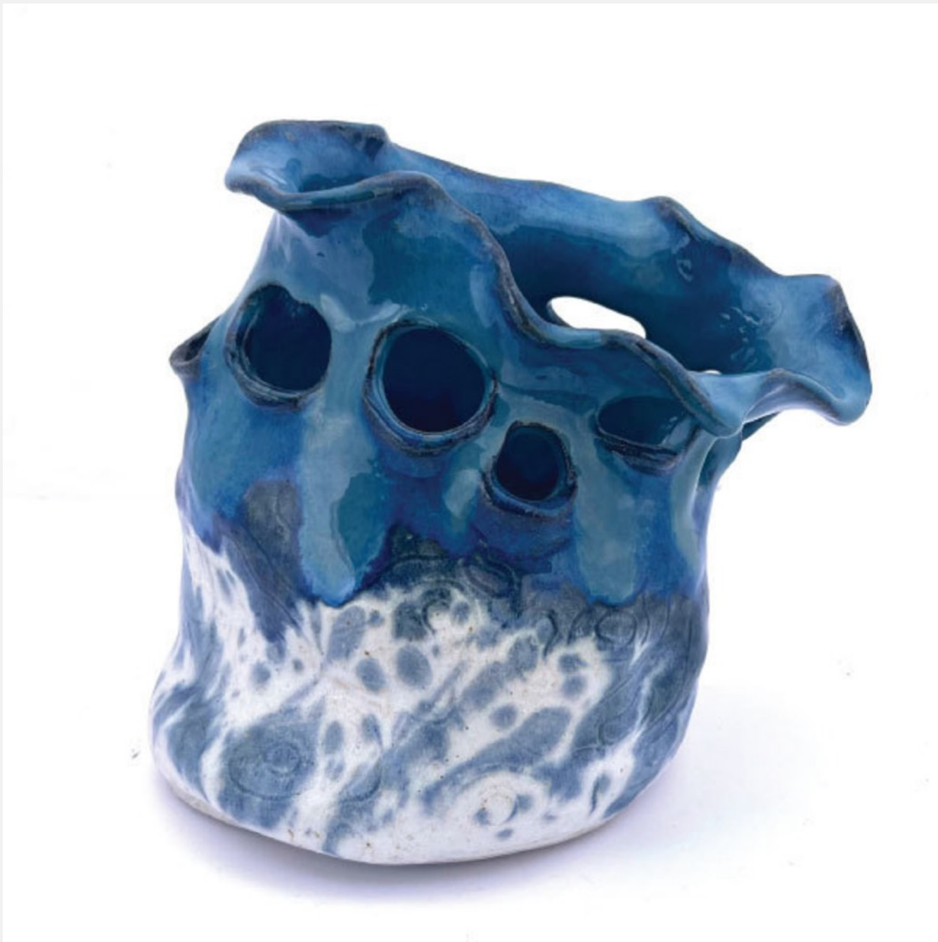
Blue Mollusk Vase Stoneware with hand painted glaze 23 x 20 x 11 cm $1,200