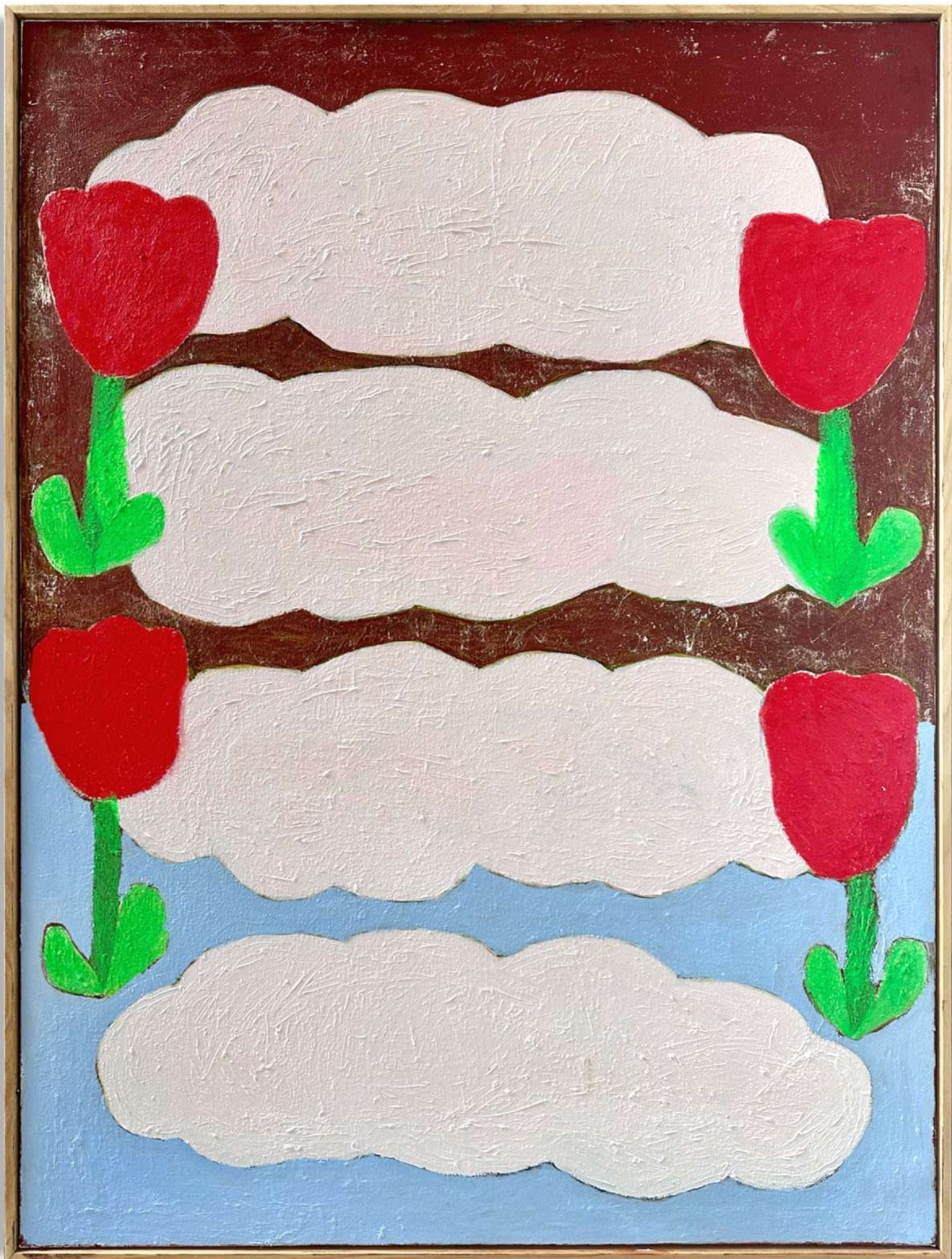
Where the happy people go Oil paint, oil stick on canvas 123 x 93 cm $5,600