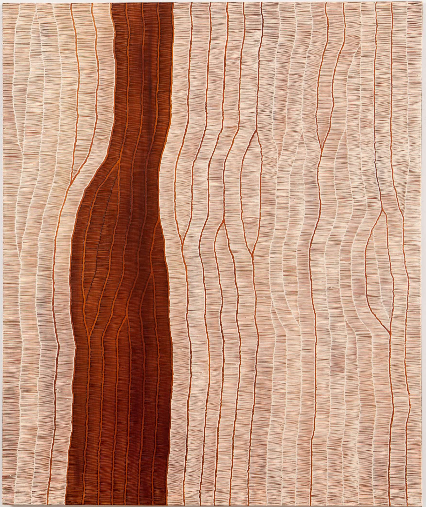
Dhalbu Iron Bark Sap Acrylic on Cotton Canvas 102 x 123 cm $8,000