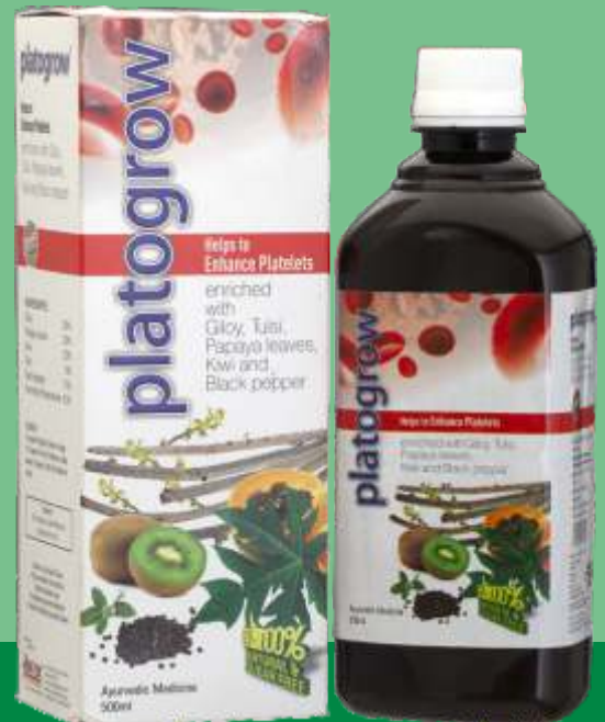
Available Packing : 500ml and 200ml