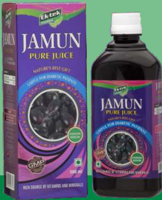
Available Packing : 500ml

Rich source of vitamin A & C. Useful for diabetic patients and helps to normalise blood sugar. Helps to control blood pressure. Helps to control harmful effects of diabetes. Helpful in reducing of and glycosuria. Helps to Purify blood and make body healthy. Helps in proper function of digestive System. Helps to improve immunity and bone strength.