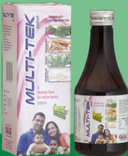
Available Packing : 200ml

Helps to balance your body with Vitamins, Minerals, Amino acids and antioxidants. Helps to enhance immune system. Useful for formulation of Strong bones and muscles. Useful for Cardiac Health. Helps to remove stomach disorders. Useful for the improvement of Eye sight. Useful for intestinal inflammation. Useful as Nervine Tonic.