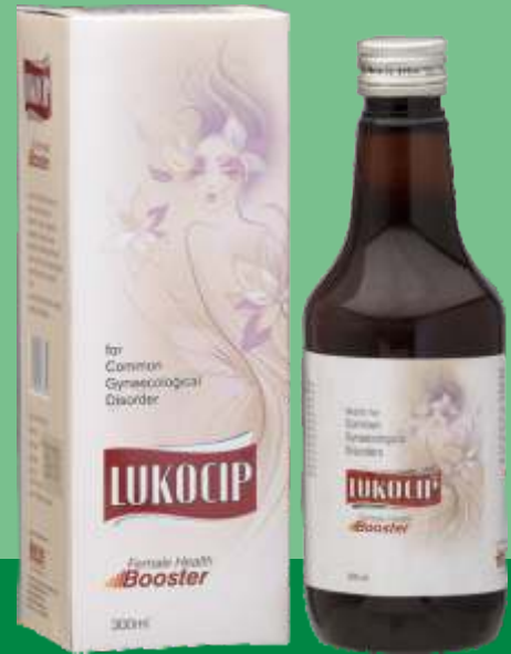
Available Packing : 300ml

Lukocip is blend of precious herbs, helps women in Anaemia, Loss of appetite, headache, Lukoria, Lower back pain, General weakness, Burning of feel, Gynecological disorders and as a uterine tonic. Lukocip helps restores women health and beauty.