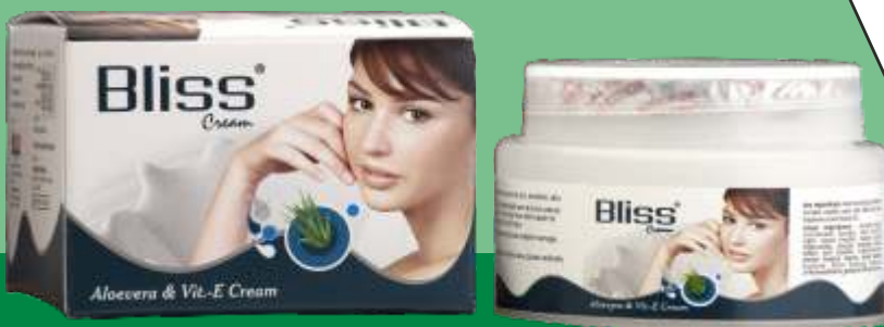
Available Packing : 50Gms

Helps skin retain moisture & protects, nourishes and restores harmony to dry, sensitive skin. Aloe vera extracts: An excellent moisture retainer for the skin, has been traditionally used to treat various skin conditions like psoriasis, eczema, inflammation, burns, and wounds also helps keep skin supple by bringing oxygen to the cells, thereby increasing the synthesis and strength of skin tissue. Vitamin-E Plays an important role in protecting skin from environmental & oxidative damage, can also decrease the effects of psoriasis and erythema.