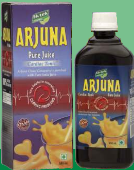
Available Packing : 500ml