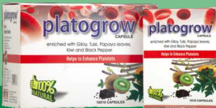
Available Packing : 10x10= 1 Box

Platogrow helps to increase Platelets. Also helpful in Dengue, Chikungunya & Swine Flu. Helpful in all kind of Flu & Fever. Beneficial in Acidity & Indigestion. Helpful in Diabetes and Rheumatoid Arthritis.