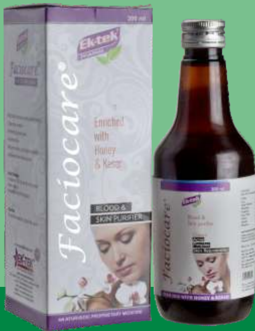
Available Packing : 300ml