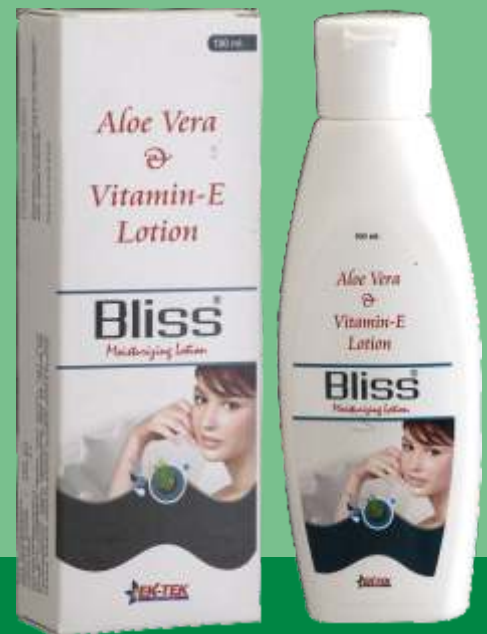
Available Packing : 100ml