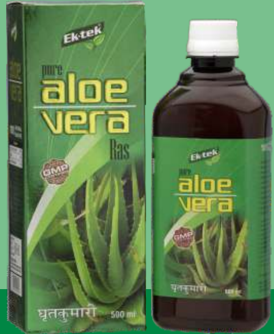
Available Packing : 500ml and 1 Litre

Helps digestion & keeps stomach healthy. Helps to activate Liver. Helps Improves Immunity. Helpful in Arthritis and joint swelling. Useful to regulate menstrual cycle. It may help in thalassemia. Useful in menopausal syndrome. Ueful in piles and kidney malfunctioning. It may help to reduce weight. Useful as an antioxidant.