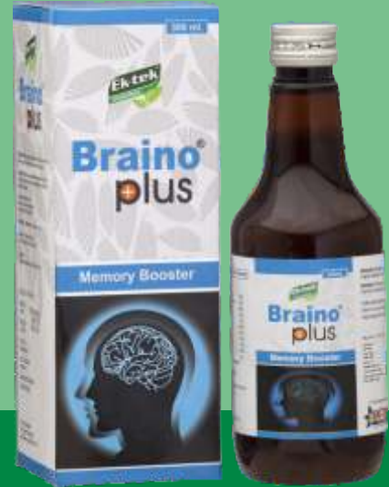
Available Packing : 300ml

BRAINO PLUS is delicious blend of precious herbs, which is highly helpful for persons of all ages. BRAINO PLUS is scientifically developed formula helps to improve memory, concentration & relieves stress and anxiety