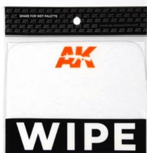
AK8073 WIPE (wett palette replacement)