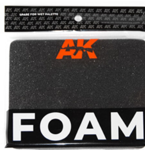
AK8075 FOAM (wett palette replacement)

There will always be spare parts available for the components of the Wet Palette, and the correct size, ready to be used.