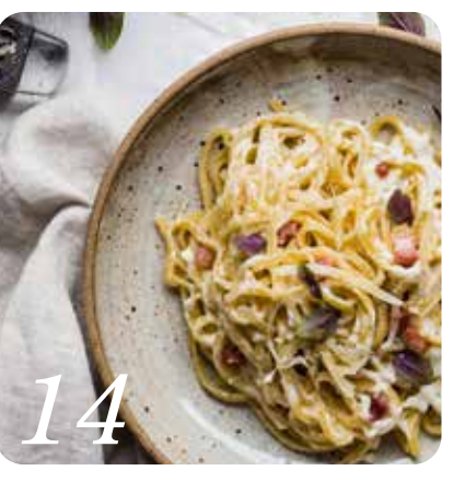
EASY PEASY CARBONARA