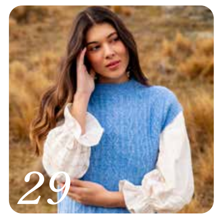
HOW TO WEAR VESTS