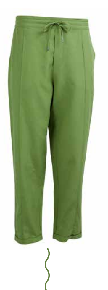
Fig Mixed Knit AU: $99.95 NZ: $109.95