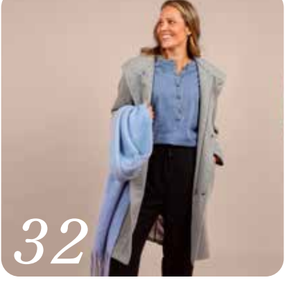
1 PIECE 3 WAYS