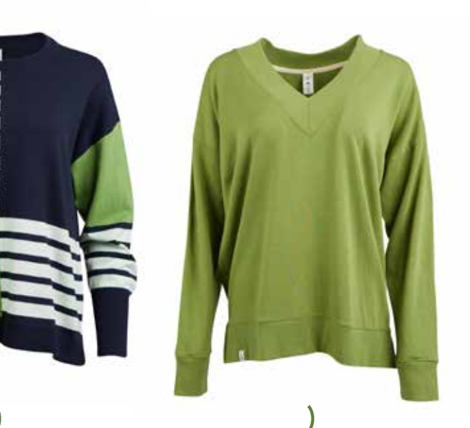
Misty Vee Fleece AU: $99.95 NZ: $109.95

Idyll Floral Shirt AU: $99.95 NZ: $109.95