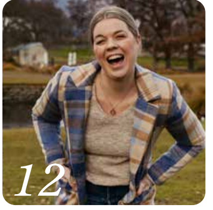
MEET ELM'S HEAD DESIGNER