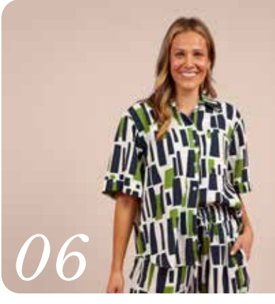
TO TWIN IS IN