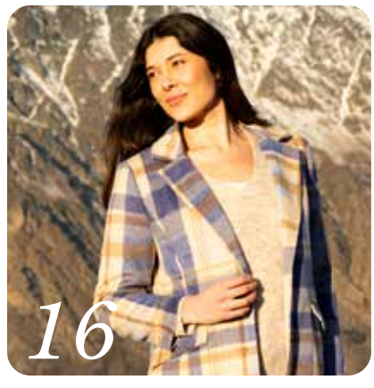
AUTUMNS IDEAL LAYERS