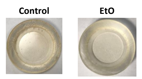
Figure 4 Color discs before and after EtO sterilization

When exposed to EtO sterilization, Ultracur3D® ST 45 demonstrates a 36 % increase in elongation at break and 16 % decreases in modulus. The samples also show a 7 % decrease in ultimate strength. The test specimens show a small color change but become slightly lighter and more clear post-sterilization. EtO residuals level after exposure were not recorded.