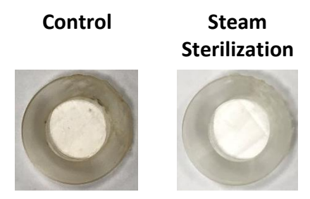
Figure 6 Color discs before and after Steam sterilization

When exposed to steam sterilization, Ultracur3D® ST 45 demonstrates a 24 % increase in elongation at break and 18 % decreases in modulus. The samples also show a 18 % decrease in ultimate strength. The test specimens show a color change but become lighter and clear post-sterilization.