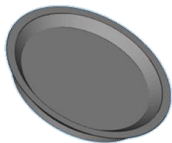
Figure 1 Color disc 2 mm