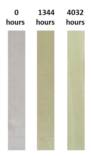
Figure 3 Effect of UV exposure on color of the specimens

The material Ultracur3D® ST 45 unfortunately shows visible yellowing after long UV exposure times.