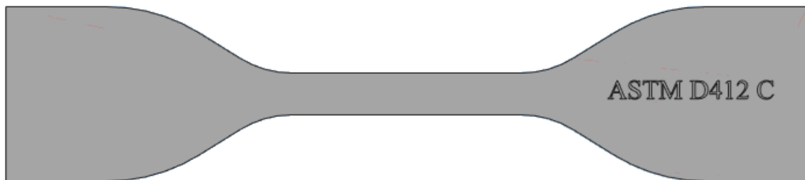
Figure 1 Tensile bar

30 tensile bars and 18 color cones were printed with the material and were kept under high intensity UV light for longer period. The parts were also exposed to periodic water sprays as described above. After the tensile bars were inside the UV oven for a stipulated time, the change in color as well as the mechanical properties like E modulus, Tensile strength and Elongation at break were measured. The tensile bars were used for mechanical testing and color cones were used to determine the color after prolonged UV exposure.