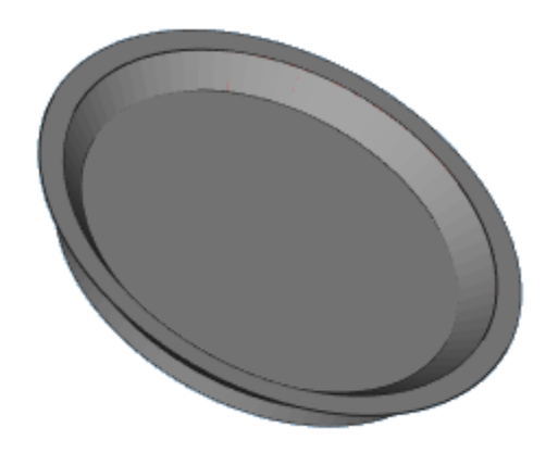
Figure 2 Color cone