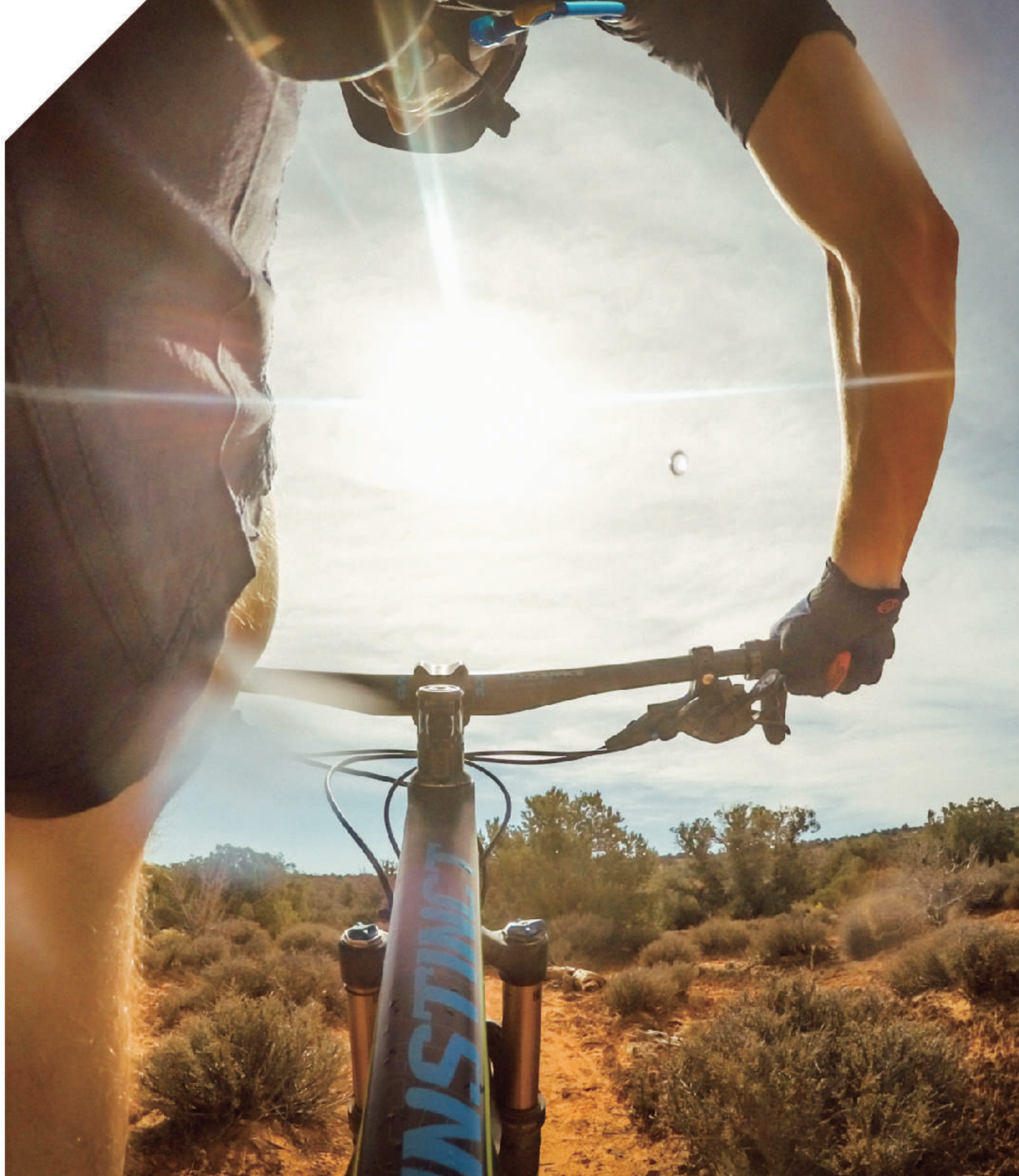
GS610 - 3