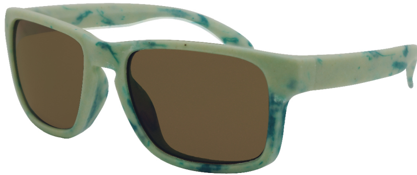
ECO-FM031 original color+Blue Fabric