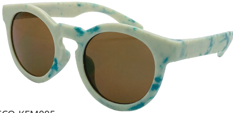
ECO-KFM005 original color+Blue Fabric