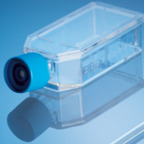
CELL CULTURE FLASK (optional)