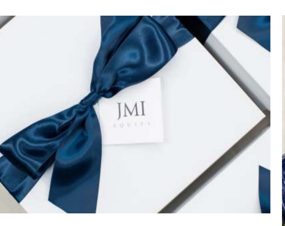
JMI EQUITY: 'Cozy-in-the-Kitchen' themed gift boxes featuring luxe items for the cook including branded apron, handmade wooden spoon and spoon rest, high end candle, and more.