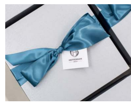
HEFFERNAN INSURANCE: Bose sport earbuds were the highlight of these holiday boxes along with branded Yetis, self-care spa items , and a few sweet treats.