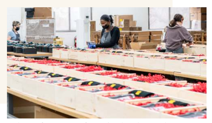
A glimpse of our 14,000 sq foot studio where the magic happens!