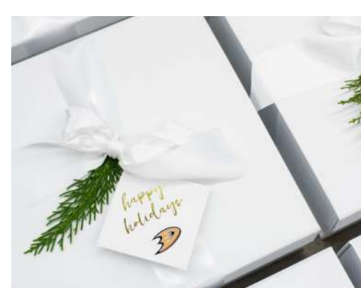
ANAHEIM DUCKS: 'Winter Wonder-land' themed gift boxes for Anaheim Ducks players to receive at their annual holiday gala featuring bubbly, custom ice skate cookies, branded coasters, and luxe items for the home.