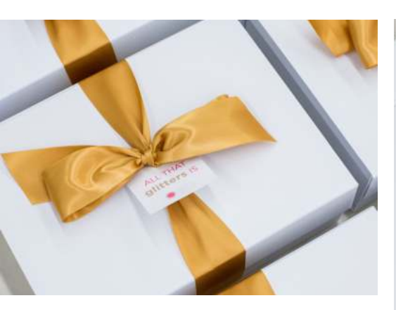
GOLD PR 2019: 'All That Glitters is Gold' themed gift boxes featuring onbrand gold, metallic, and celebratory items for recipients to use and enjoy as they ring in the New Year.