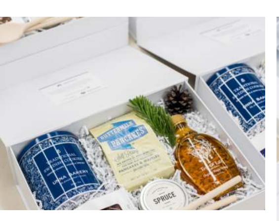
NAT GEN: On-brand pancake making kits intended to get families to gather for an activity in the kitchen, including small batch pancake mix and syrup, a handmade wire whisk, and flavored pecans as a gourmet topping.