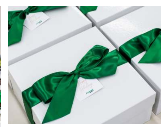
FORWARD FINANCING: Green and white boxes intentionally heavy on the sweet and savory treats intended for an entire office to enjoy while also showing off the brand's logo throughout the gifts.