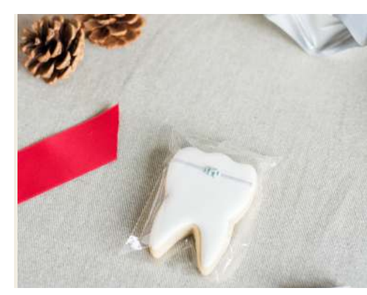
PARRISH ORTHODONTICS: Festive and bright holiday gifts for a busy orthodontics practice using their aqua logo as a twist on the traditional red and green.