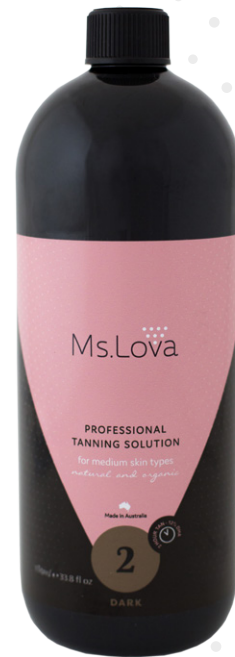
MS.LOVA NO 2

Its enriched powerful antioxidants help skin firming and rejuvenation. It also contains vitamin extracts to nourish and hydrate your client's skin. This quick drying, non-sticky and non-oily formula develops in just 2-hours, to reveal a natural and an even looking tan. This luxurious product is more than just a tan, it is an advanced tanning treatment, anti-aging and rejuvenation product.