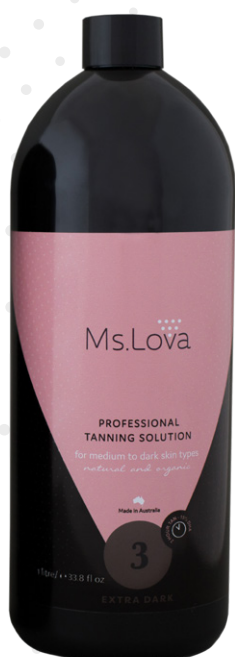
MS.LOVA NO 3

Ms. Lova 2hour Pro-Extra Dark Tanning Solution. This revolutionary product has been formulated using the highest quality certified natural and organic ingredients for a flawless deep bronzed tanning result. Enriched with natural hydrating oils, powerful anti-oxidants and vitamins this solutions offers ultimate skin hydration with the deepest, darkest tanning experience ever.