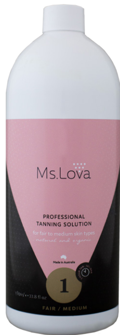
MS.LOVA NO 1

Its enriched powerful antioxidants help skin firming and rejuvenation. It also contains vitamin extracts to nourish and hydrate your client's skin. This quick drying, non-sticky and non-oily formula develops in just 2-hours, to reveal a natural and an even looking tan. This luxurious product is more than just a tan, it is an advanced tanning treatment, anti-aging and rejuvenation product.