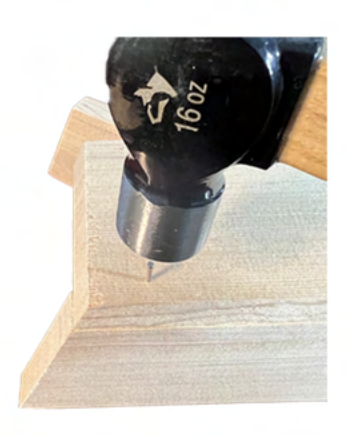
Hammer first nail. Check alignment, then hammer 2nd nail.