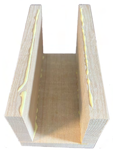
Turn house over and place glue on inside edges of both sides.