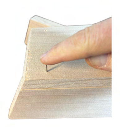
Push finish nails into both holes.

Place the bottom piece on top of side 1. Align the pieces so angles form a straight line.