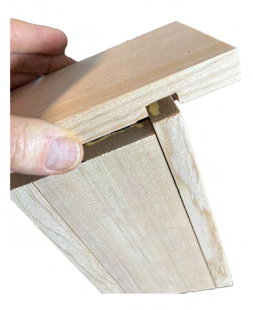
Align back of house to the glued edges and press in place.