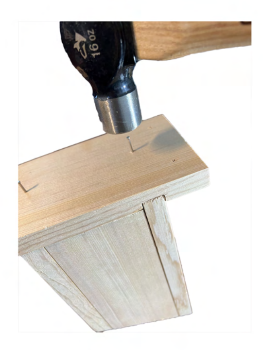
Position both nails in pre-drilled holes and hammer them in.