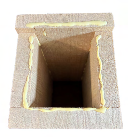
Place glue along inside edges of back of house.

Press a nail into each of the four predrilled holes on the top and hammer them in place to secure top to sides.