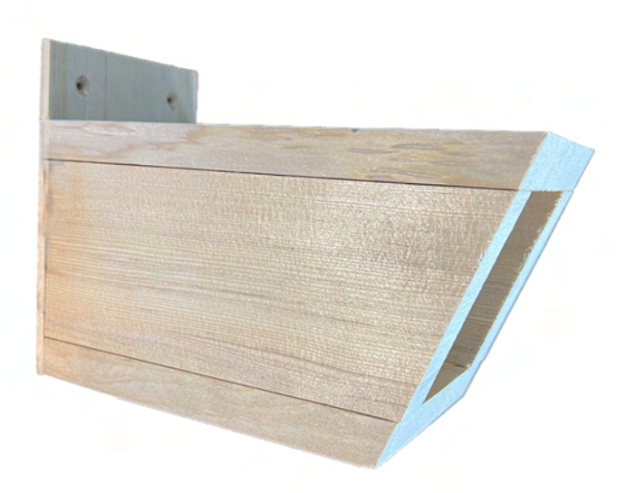
Sand edges and sides as necessary. You can paint or stain your bee house to extend its life.