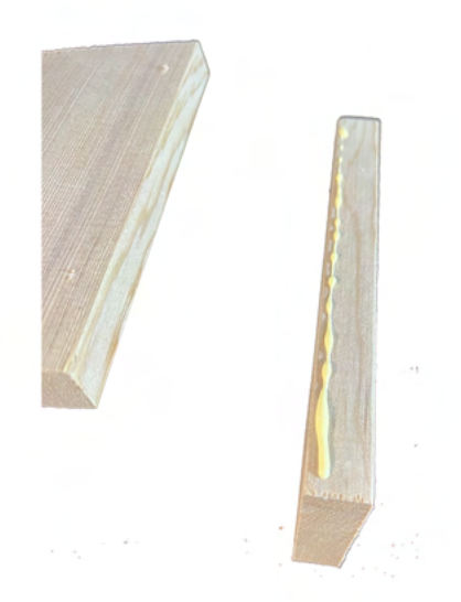
Ensure the angle on side 2 is facing the same direction as side 1. Angles face front. Place glue on inside edge.