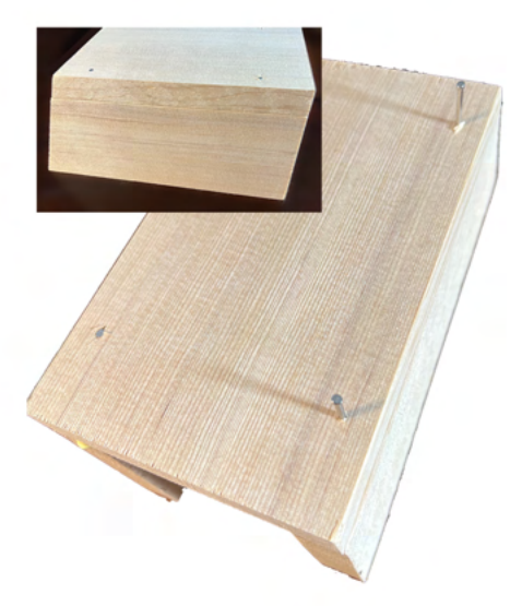
Push finish nails into both holes. Hammer in both nails. Ensure side stays aligned.