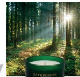
DUBLIN RETREAT MUSK, BLACK EBONY & AMBER