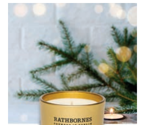
DUBLIN CHRISTMAS EUCALYPTUS, MINT & PINE

Rathbornes is proud to introduce a new Dublin Discovery Set, an exclusive collection comprising five fragrant favourites, each inspired by the historic capital - Dublin City.