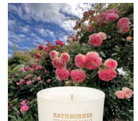
DUBLIN TEA ROSE OUD & PATCHOULI