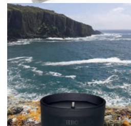
DUBLIN DUSK SMOKED OUD & OZONIC ACCORDS

The Dublin Discovery Set invites you to embark on a sensory journey through the diverse landscapes of Dublin. This journey seamlessly weaves together the art of fragrance with the art of storytelling. Each candle within the set tells a unique story, drawing inspiration from various corners of the capital. The "Dublin Dusk" scent transports you to Dublin's breathtaking coastline, while the "Dublin Retreat" fragrance captures the essence of the iconic Phoenix Park, a lush tranquil sanctuary nestled within the city.