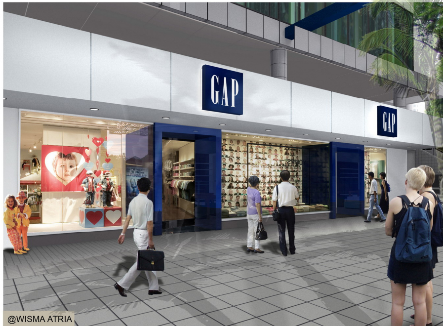
Shopfront Perspective visuals View From Street Side