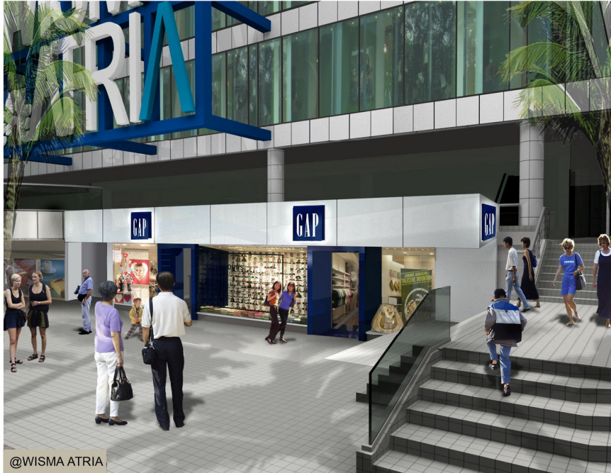
Shopfront Perspective visuals View From Street Side