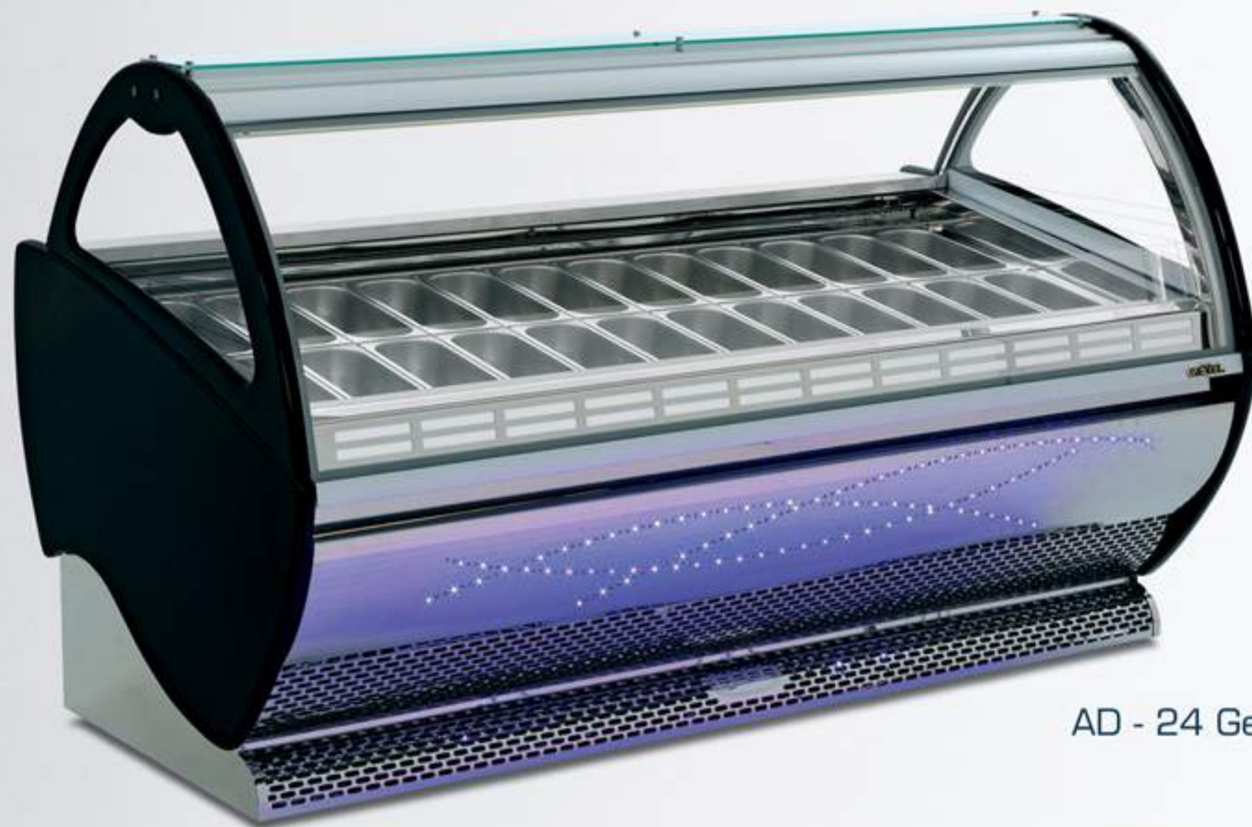
AD - 24 Gelato