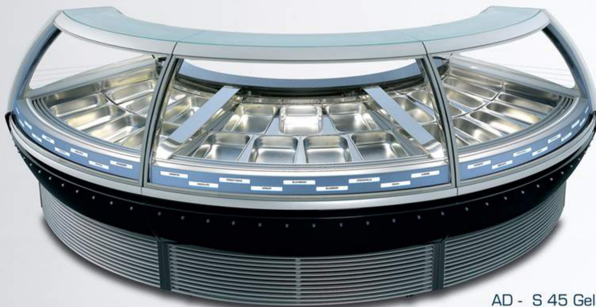
AD - S 45 Gelato