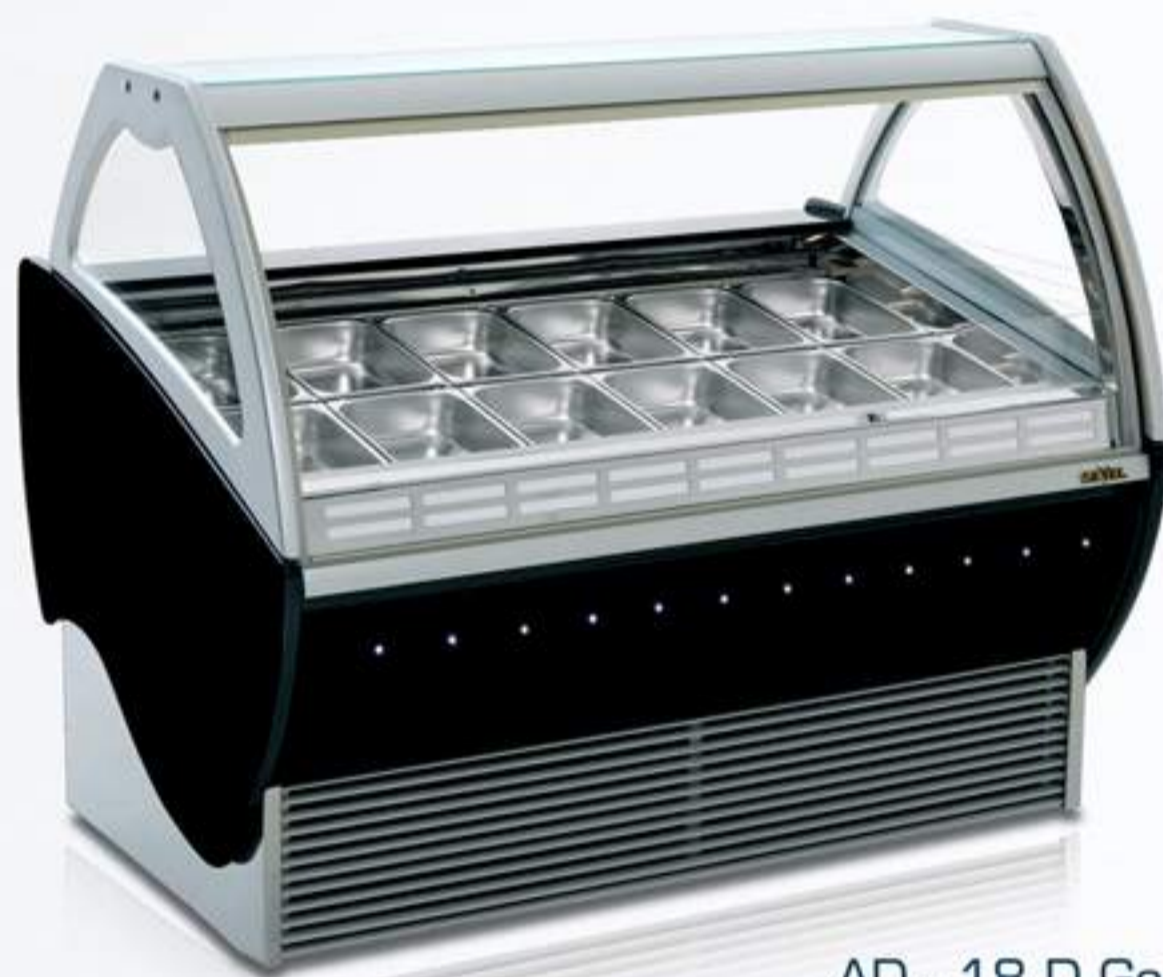
AD - 18 D Gelato