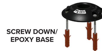
SCREW DOWN/ EPOXY BASE