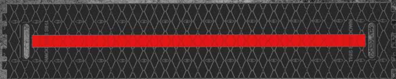
Embedded Text and Red Stripe on Bottom of RoadQuake 2F TPRS (1/2 Strip Shown)