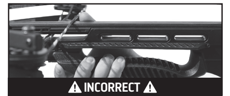
⚠ INCORRECT ⚠