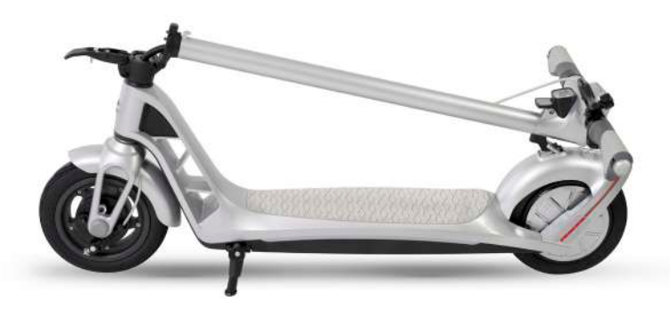
Figure 4. Folding Complete