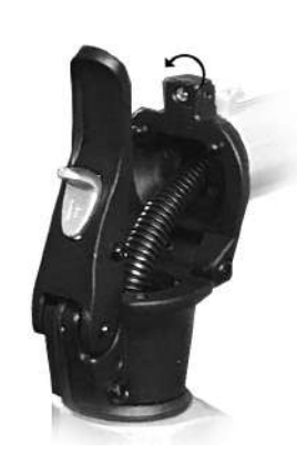
Figure 8. Fasten Folding Mechanism Screw