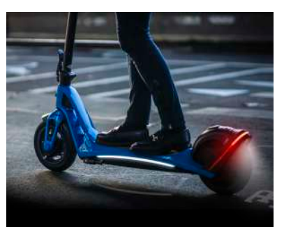
Figure 4. Operate with Caution