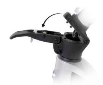
Figure 2. Safety Lever