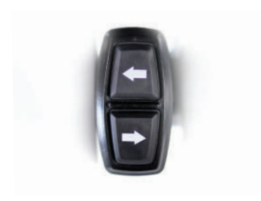
LEFT & RIGHT TURN SIGNAL MECHANISM