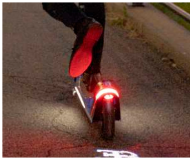
Figure 2. Do Not Lift Feet