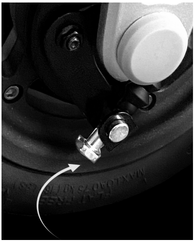
Figure 4. Fasten Clockwise