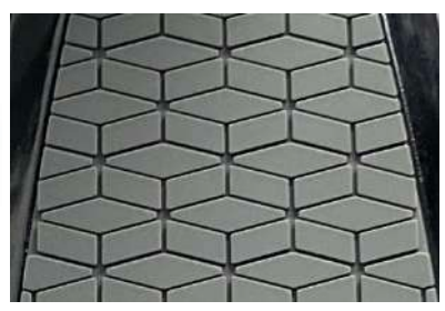
ERGONOMIC RUBBER DECK