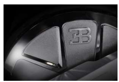
BUGATTI EB LOGO:WHEEL CAP