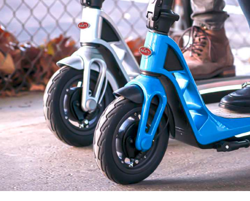
Figure 1. Kickstart