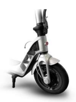
Figure 3. Charging Port Cap