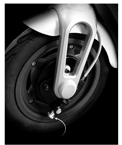
Figure 3. Fasten Counterclockwise