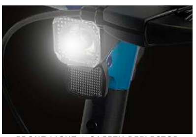
FRONT LIGHT & SAFETY REFLECTOR