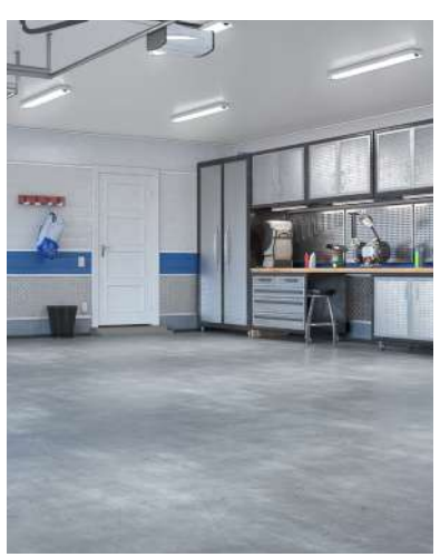
Figure 2. Cool Dry Storage Area