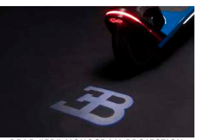
REAR "EB" MONOGRAM PROJECTION LOGO