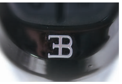
BUGATTI EB LOGO: DASHBOARD