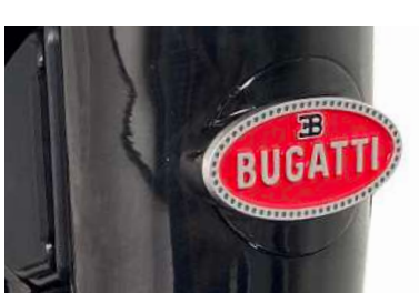
BUGATTI MACARON LOGO