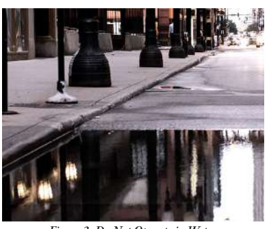
Figure 3. Do Not Operate in Water