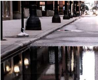
Figure 3. Do Not Operate in Water