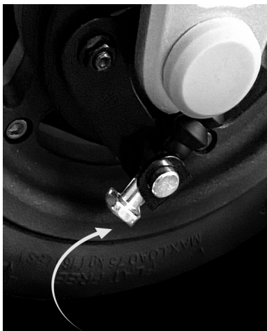
Figure 4. Fasten Clockwise