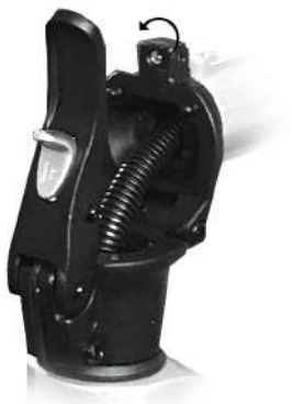
Figure 8. Fasten Folding Mechanism Screw