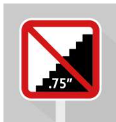
Avoid High Steps

DO NOT OPERATE AT HIGH SPEED ON BUMPY ROADS.