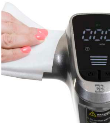
Figure 1. Use Soft Damp Cloth