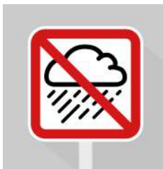
Do Not Operate in the Rain