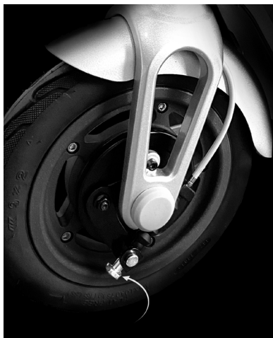
Figure 3. Fasten Counterclockwise