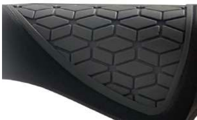
ERGONOMIC HANDLE GRIPS