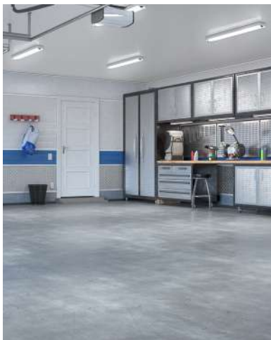
Figure 2. Cool Dry Storage Area