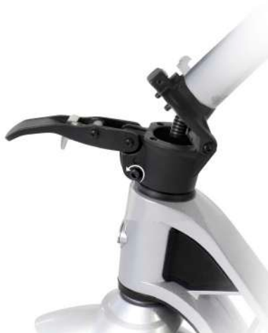
Figure 6. Secure Stem Base