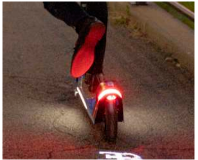
Figure 2. Do Not Lift Feet