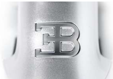
BUGATTI EB LOGO: REAR MUD GUARD