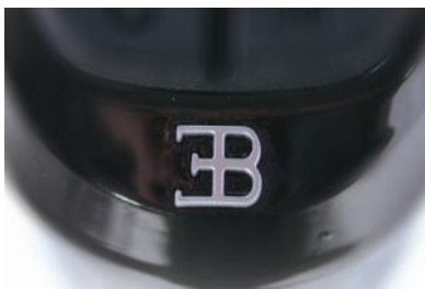
BUGATTI EB LOGO: DASHBOARD