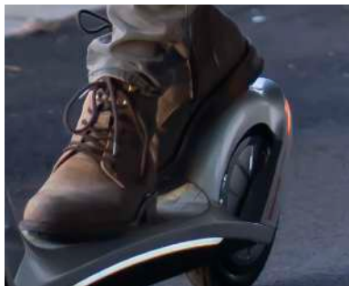
Figure 5. Avoid Pressure on Mud Guard