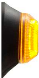
DUAL TURN SIGNAL LIGHT CAPS