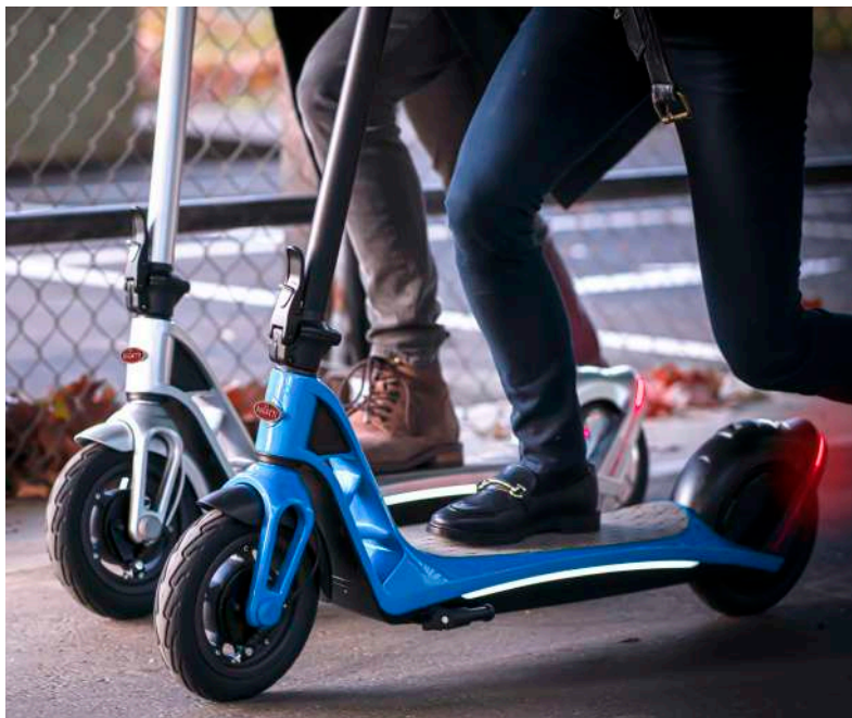
Figure 1. Kickstart