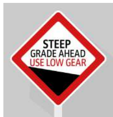
Proceed with Caution

DO NOT PRESS POWER THROTTLE TO ACCELERATE WHEN GOING DOWNHILL. PROCEED WITH CAUTION.