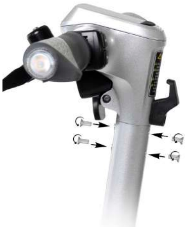
Figure 5. Secure Front Tube