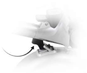
Figure 3. Secure Hook and Buckle