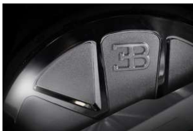
BUGATTI EB LOGO: WHEEL CAP