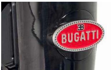
BUGATTI MACARON LOGO