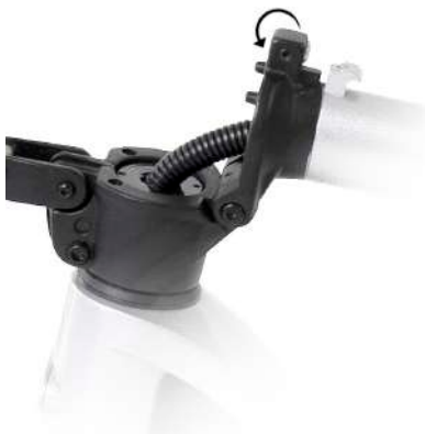
Figure 7. Remove Screw on Folding Stem