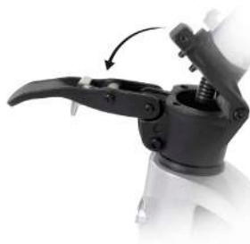
Figure 2. Safety Lever