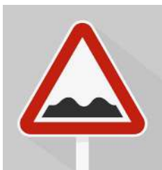
Avoid Bumpy Roads

DO NOT PRESS POWER THROTTLE TO ACCELERATE WHEN GOING DOWNHILL. PROCEED WITH CAUTION.