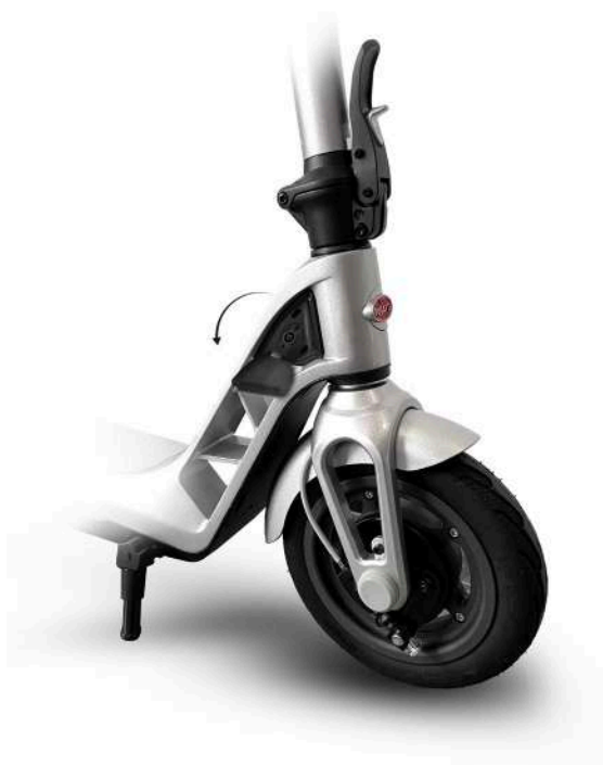
Figure 2. Open Charging Port Cap