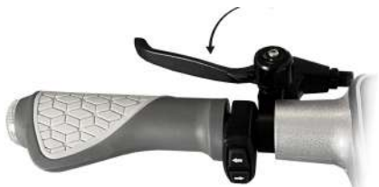
Figure 3. Left Brake Lever