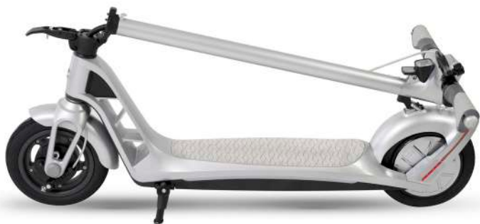
Figure 4. Folding Complete