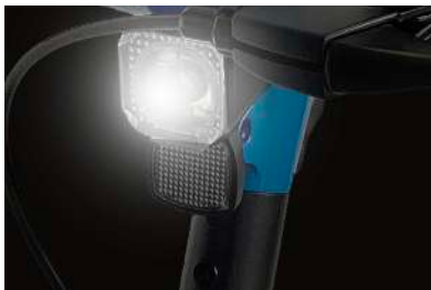
FRONT LIGHT & SAFETY REFLECTOR