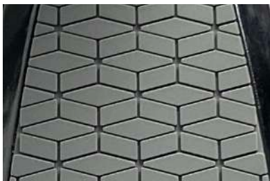
ERGONOMIC RUBBER DECK