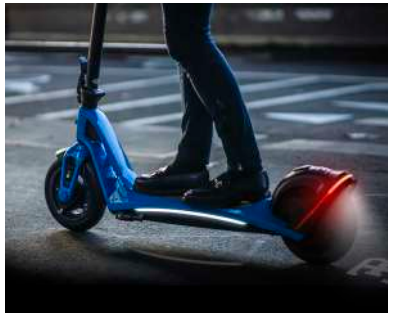
Figure 4. Operate with Caution