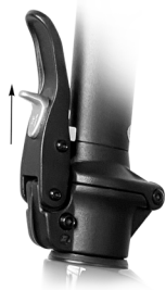
Figure 1. Safety Lock