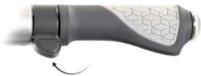
Figure 2. Right Power Throttle