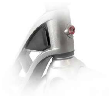
Figure 1. Charging Port Cap