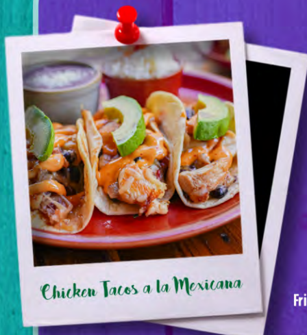
Chicken Tacos a la Mexicana

★ Raw, undercooked and barely cooked foods of animal origin such as beef, eggs, fish, lamb, milk, poultry or shellfish increases the risk of foodborne illness, individuals with certain health conditions may at higher risk if these foods are consumed raw or undercooked.