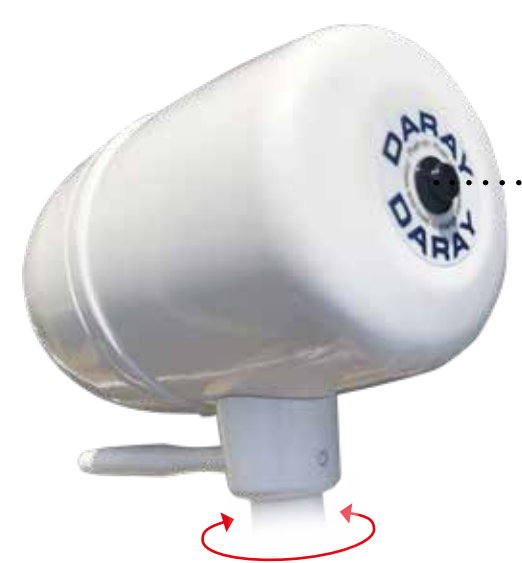
320° Head Rotation