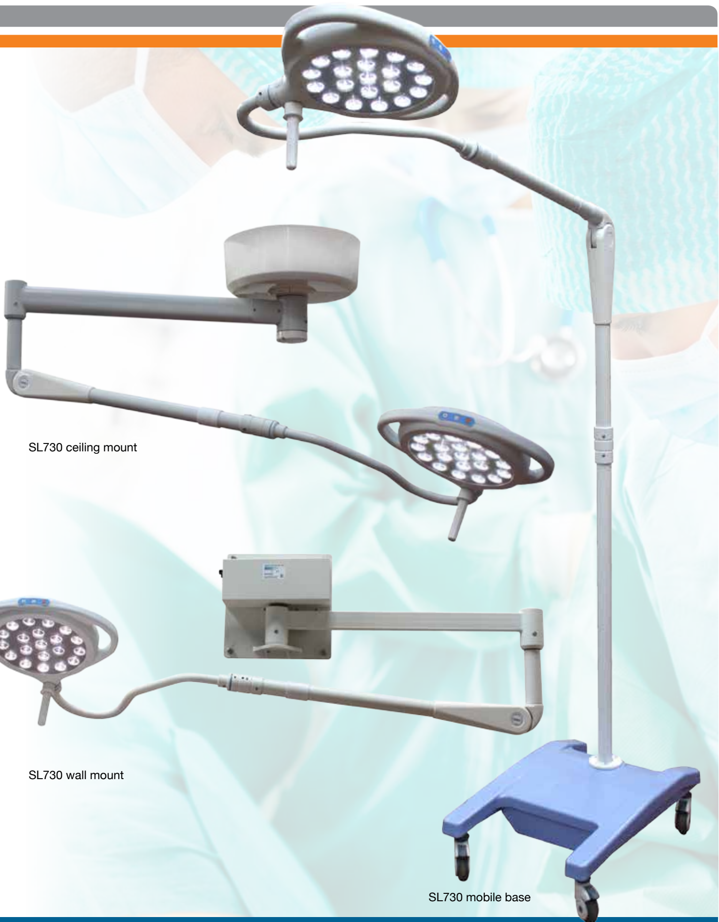
SL730 ceiling mount