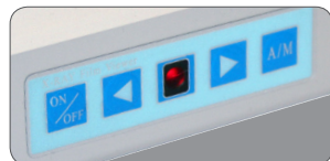
DX4101LED control panel