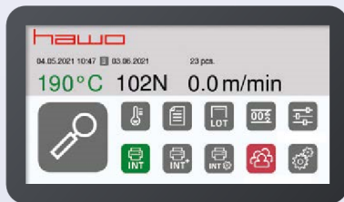
Self configurable main screen