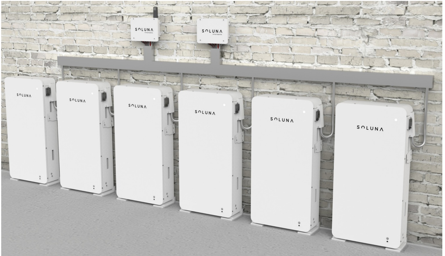
Diagram for 10 units parallel connection