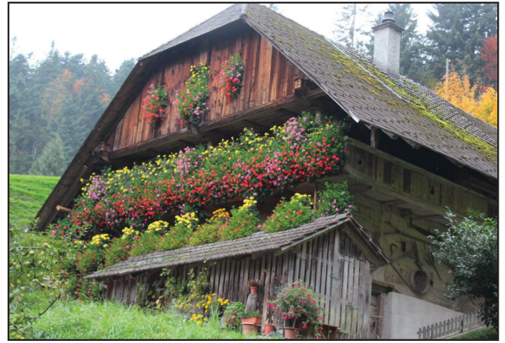
One of the many beautiful Swiss homes with flowers everywhere.