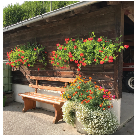
Colorful flower boxes are everywhere!