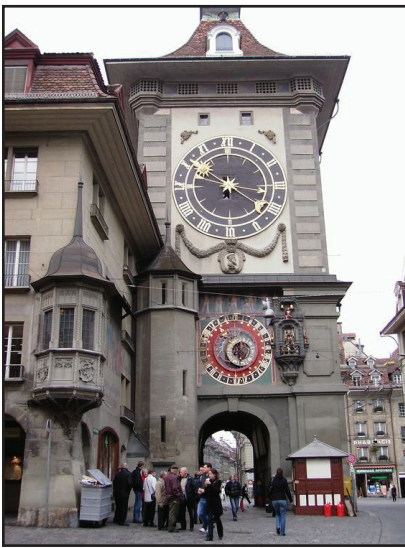
Bern Clock in Bern, Switzerland.