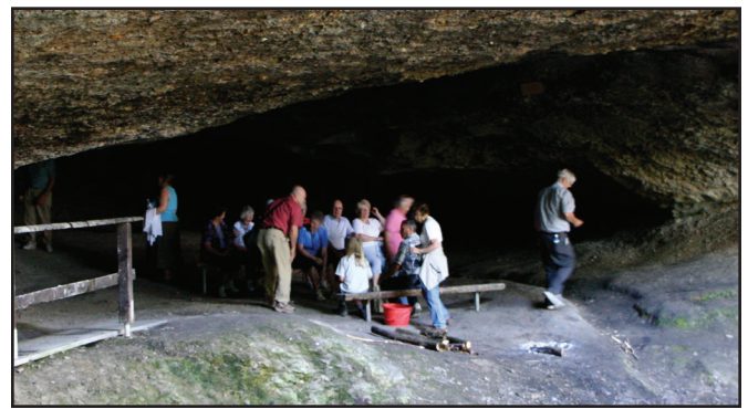
Hiking to the Anabaptist Cave is not only a rewarding accomplishment, but also a solemn moment as we reflect on the freedom of worship we have.