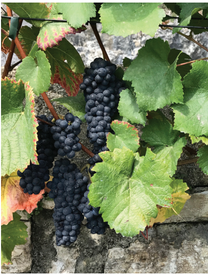
Grape vineyards along the Rhine River.