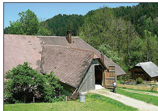
The Täuferversteck—a hiding place for Anabaptists—was used in the 1600s to escape from persecution. We will visit it here in this Swiss barn owned by Simon and Regula Fankhauser.