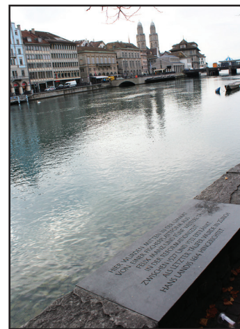
Memorial plaque along the Limmat River in Zürich shows the site where Felix Manz was drowned. The Grossmünster Cathedral is in the distance.

A morning drive will take us to near Bäretswil (Weavers/Webers lived here) to hike up to the Täuferhöhle (Anabaptist Cave) where Anabaptists worshipped in secret. We will ponder the freedom we can experience today to worship unmolested in stark comparison to how the Anabaptists hiked to this cave at night in the dark for secret worship. After a meal prepared by the Fischer family at a nearby restored mill, we will drive