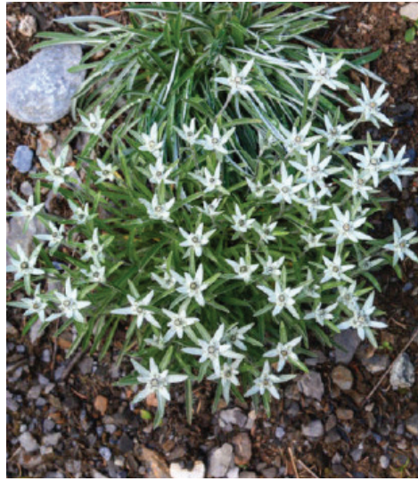
Lovely Swiss Edelweiss.