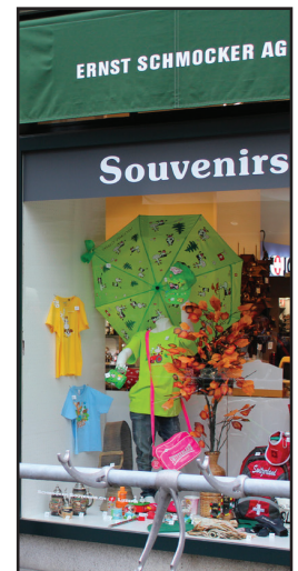
Schmocker Store in Luzerne.

This morning, we visit Hirzel—hometown of Johanna Spyri, the author of Heidi . The Hirzel Reformed Church was built from money confiscated from Landis Anabaptist families forced to leave Switzerland. Our stop at Einsiedeln, the site of a monastery founded in 934 in Canton Schwyz, emphasizes the extreme differences in worship! Our lunch stop will be at Luzerne—the first city in the Swiss Confederacy—where the famous wooden chapel bridge dating to 1333 welcomes us with its painted gables. Then we will enjoy an exciting drive through the Susten Pass before arriving at Brienz along a beautiful lake with cheese fondue and an alphorn concert tonight!