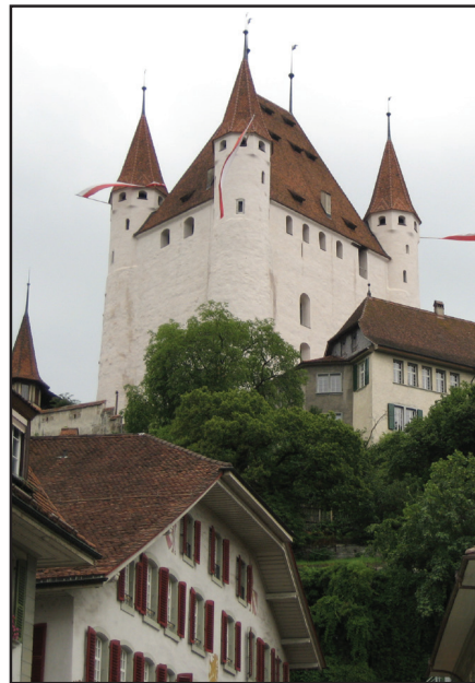
The Thun Castle where Anabaptists were chained in the prison towers. Yes, we will walk to the top to look out over the city.

We are now in the Emmental Valley where many of the Lancaster County, Pa., Mennonites originated. One of these nights in the Emmental, we will enjoy some yodeling music!