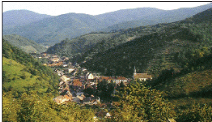
Sainte-Marie-aux Mines nestled in the valley where Jakob Ammann and many other Amish settled in the late 1600s.