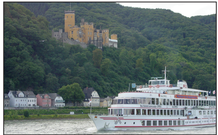
Ride past the same castles our ancestors rode past on the Rhine River.