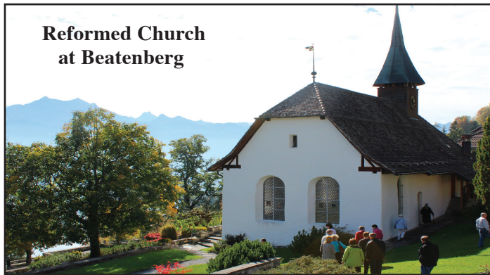
Reformed Church at Beatenberg

Our visit to Ballenberg (open air museum)—the “Williamsburg of Switzerland”—is a delightful stroll through the past. More than 100 century-old buildings from all over Switzerland, 250 farmyard animals, traditional, old-time gardens and fields, demonstrations of local crafts and other special events create a vivid impression of rural life in days gone by. Then it is on to the mountain town of Beatenberg where Smuckers lived and, in fact, Schmocker families