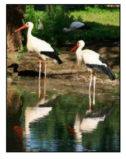
Storks in Alsace, France.

Our first stop for the day is at the old Trachselwald Castle built in 1200 A.D. where Brechbill, Mosimann, Leichty, and Sommer Anabaptists were imprisoned in prison cells that can be seen yet today. Then it is on to one of our favorite shopping places-the Jakob Markt-where the locals shop! While most of us shop, the rest can drink a cup of free coffee. If you always dreamed of purchasing Swiss lace curtains, this is the place! And the variety of Swiss chocolate bars and delicious Emmental Tea will also help to fill your luggage to take back home. Then it is north to stop at the Emmentaler Schaukäserei (cheese factory) for lunch before our afternoon drive north to Liestal to visit the Bienenberg Bible School where we will stay overnight.