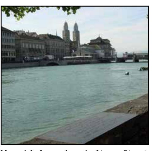
Memorial plaque along the Limmat River in Zürich shows the site where early Anabaptist Felix Manz was drowned in 1527. The Grossmünster Cathedral is in the distance.

nearby restored mill, we will continue on to the city of Zürich the birthplace of