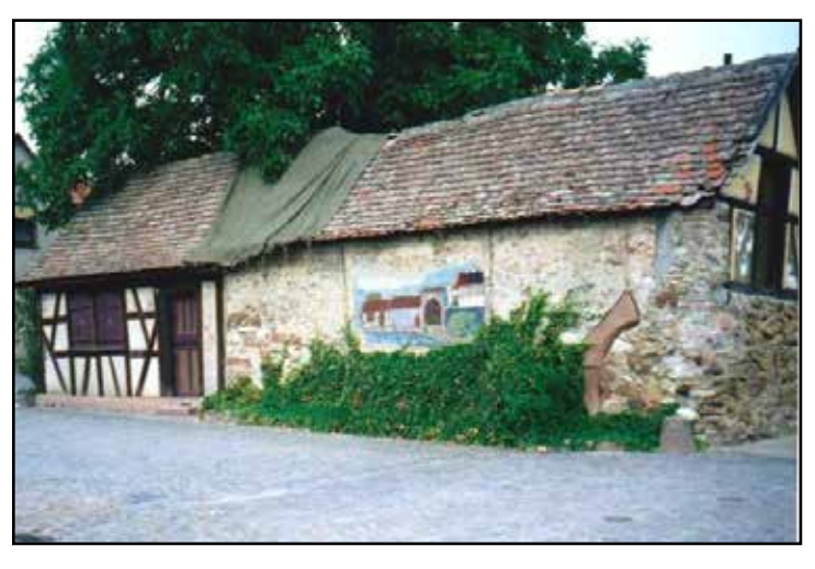
The oldest building in Ibersheim, Germany, where the Bruppachers lived.

Fly home from the Zurich Airport with many good memories.