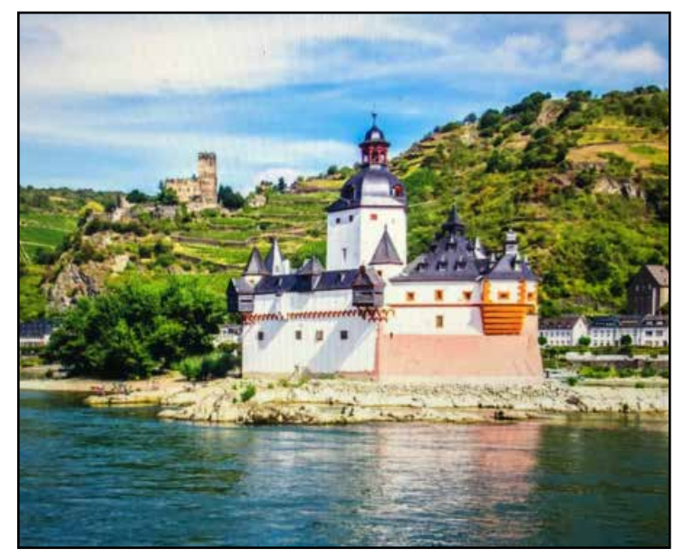
One of the many castles that we will pass by on our Rhine River cruise. This toll castle was built between 1326 and 1327 and is called the Pfalzgrafenstein Castle .