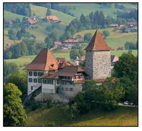
We climb to the top of the Trachselwald Castle tower to see where Anabaptists were imprisoned in the 1500s.