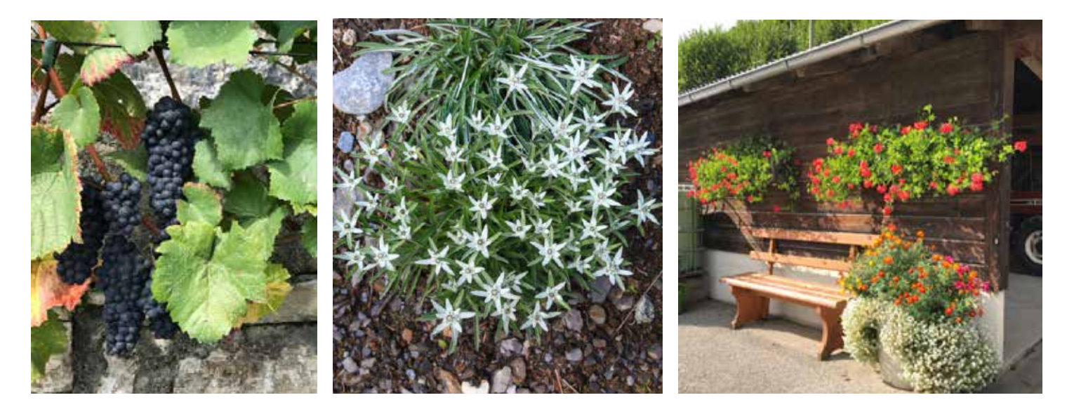
Grape vineyards along the Rhine River.