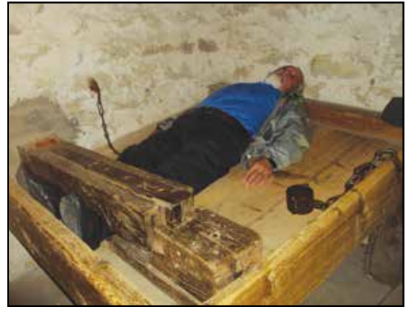
It is a solemn moment to consider placing one of our group into the stocks in an old prison cell at Trach-selwald .