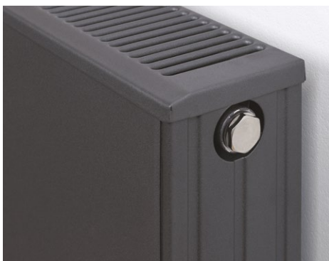
Type 22 with top grille and welded side panels