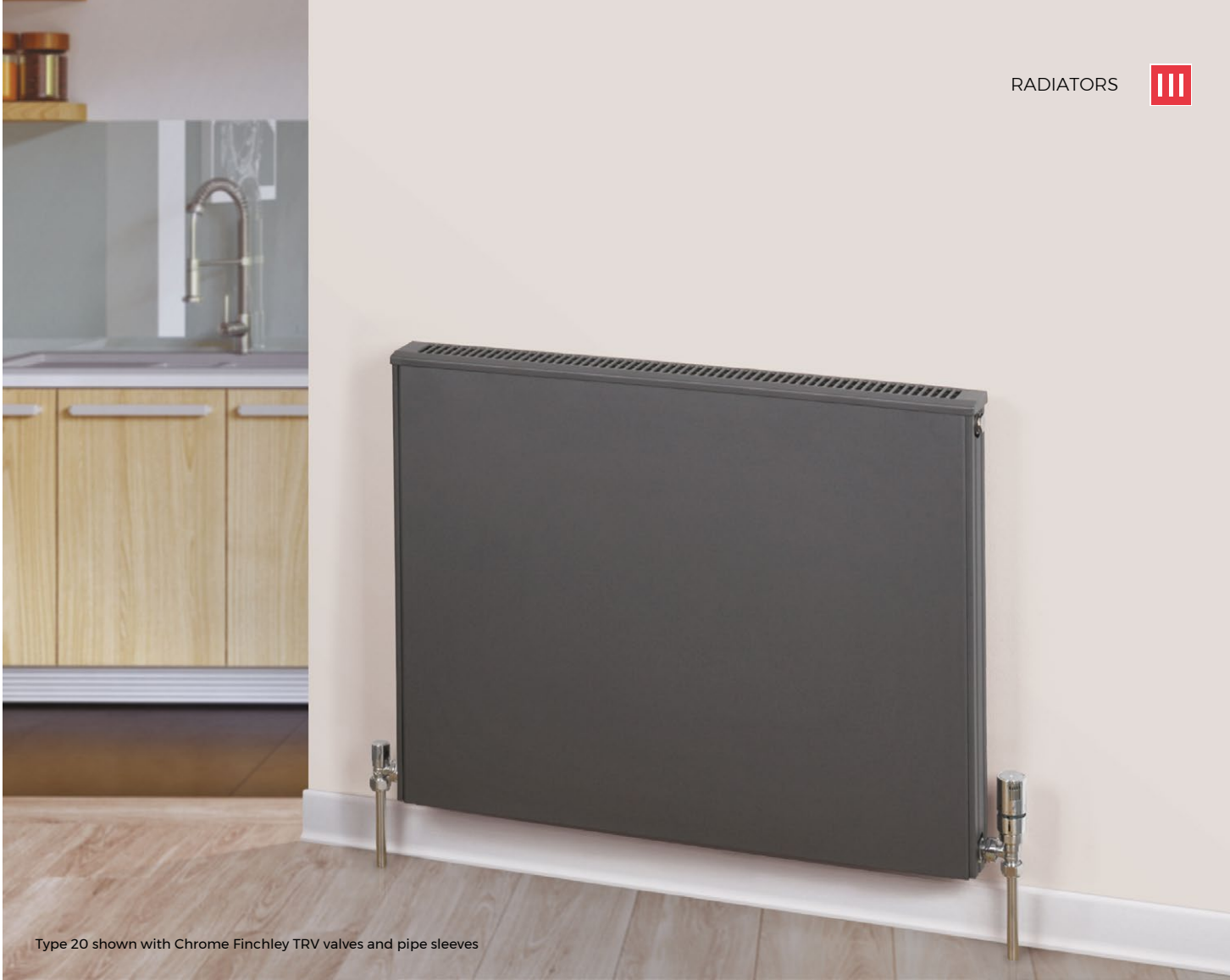
Type 20 shown with Chrome Finchley TRV valves and pipe sleeves