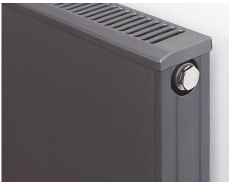
Type 20 with top grille and welded side panels