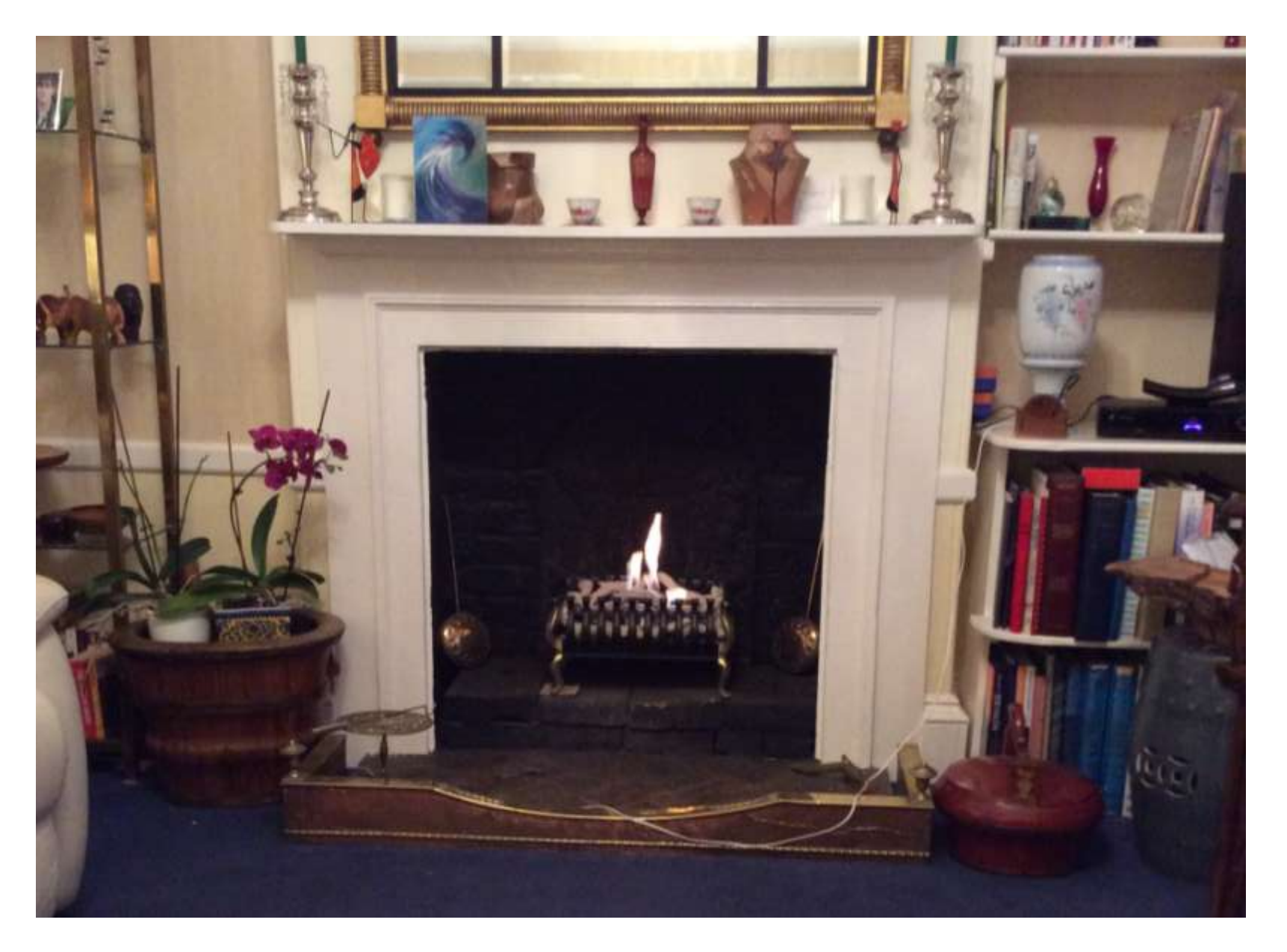
Bio fire burning in fireplace