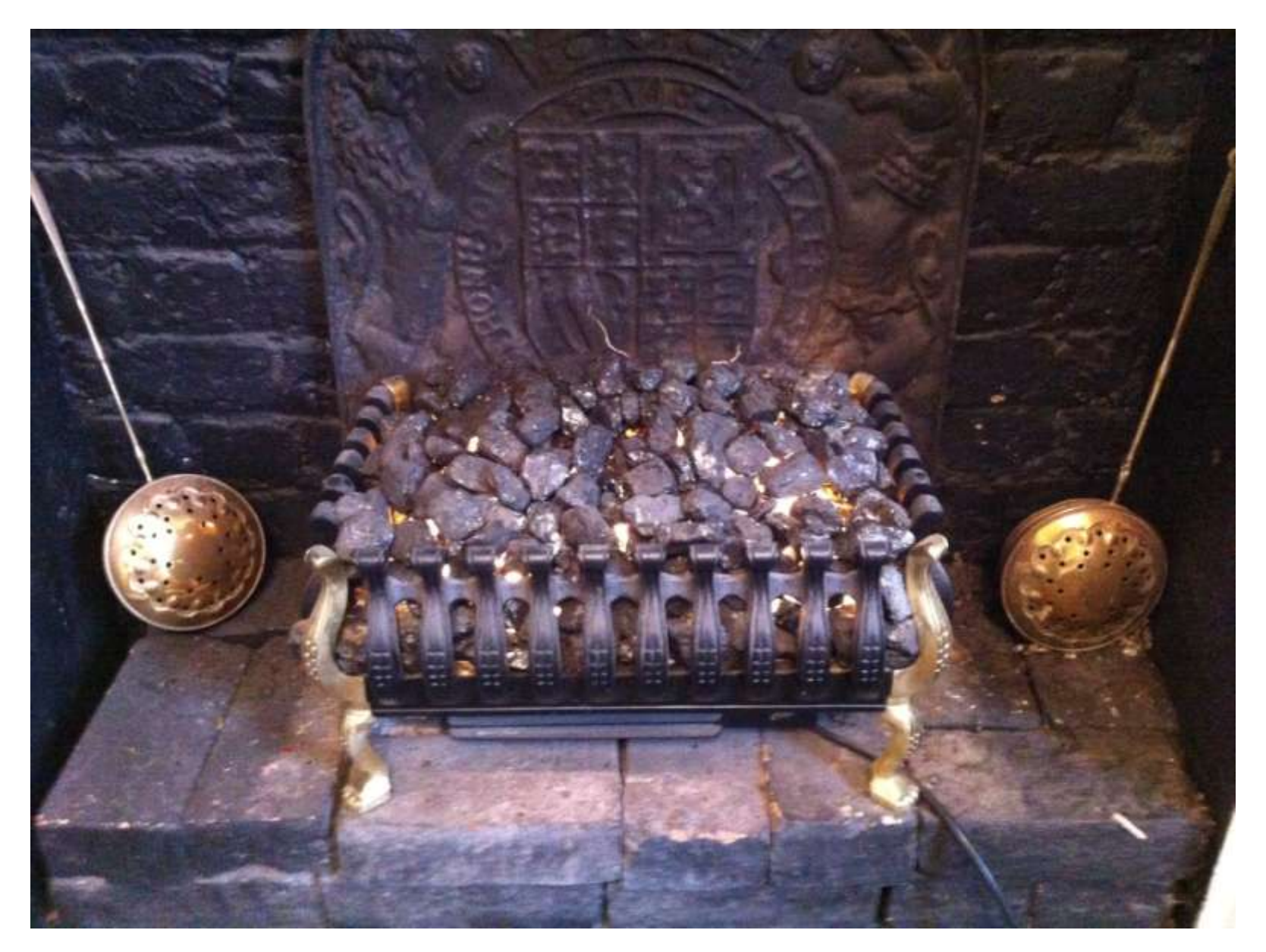
Original electric bulb & fan heater fire, nice cast aluminium & brass grate