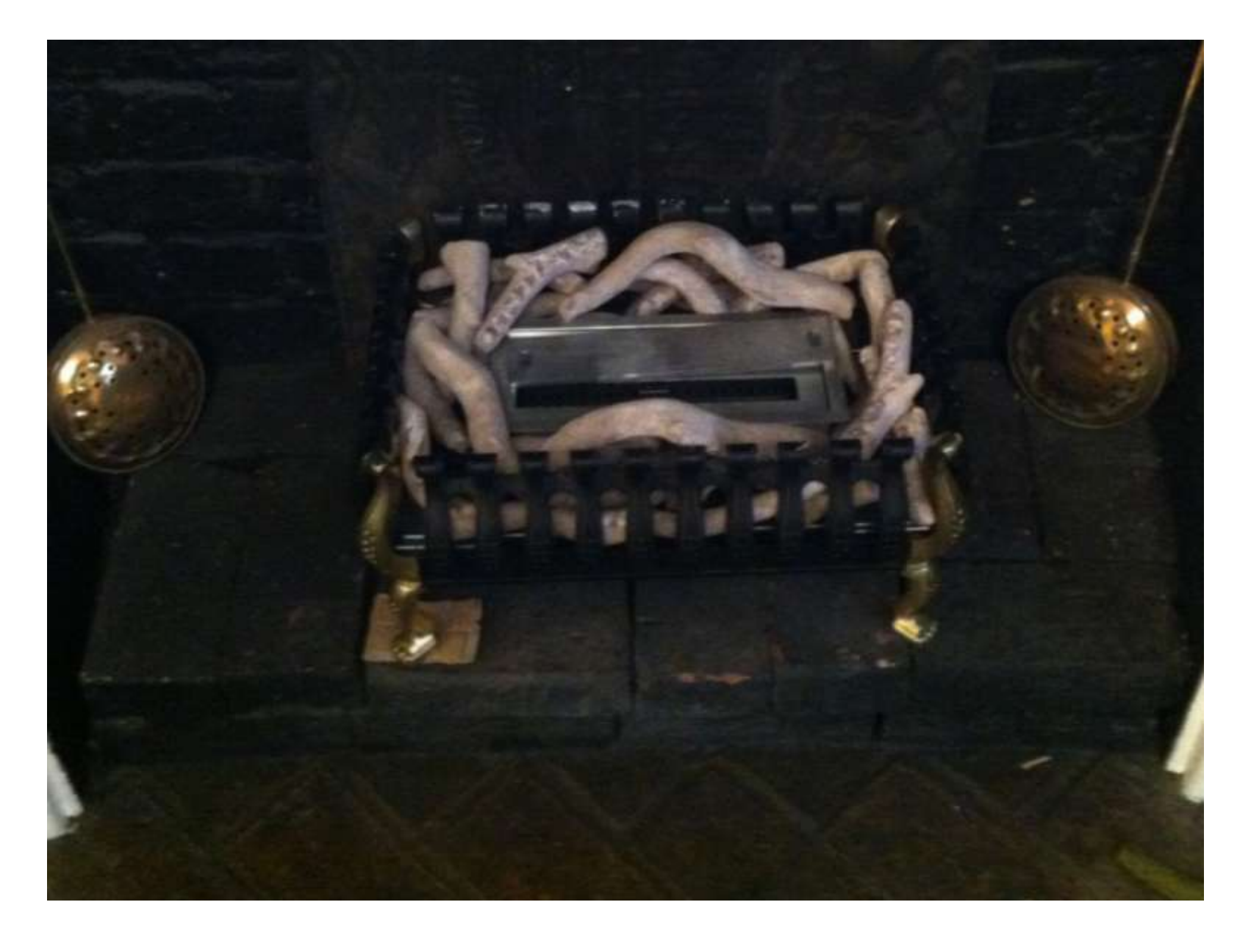
Arrange ceramic driftwood logs around burner