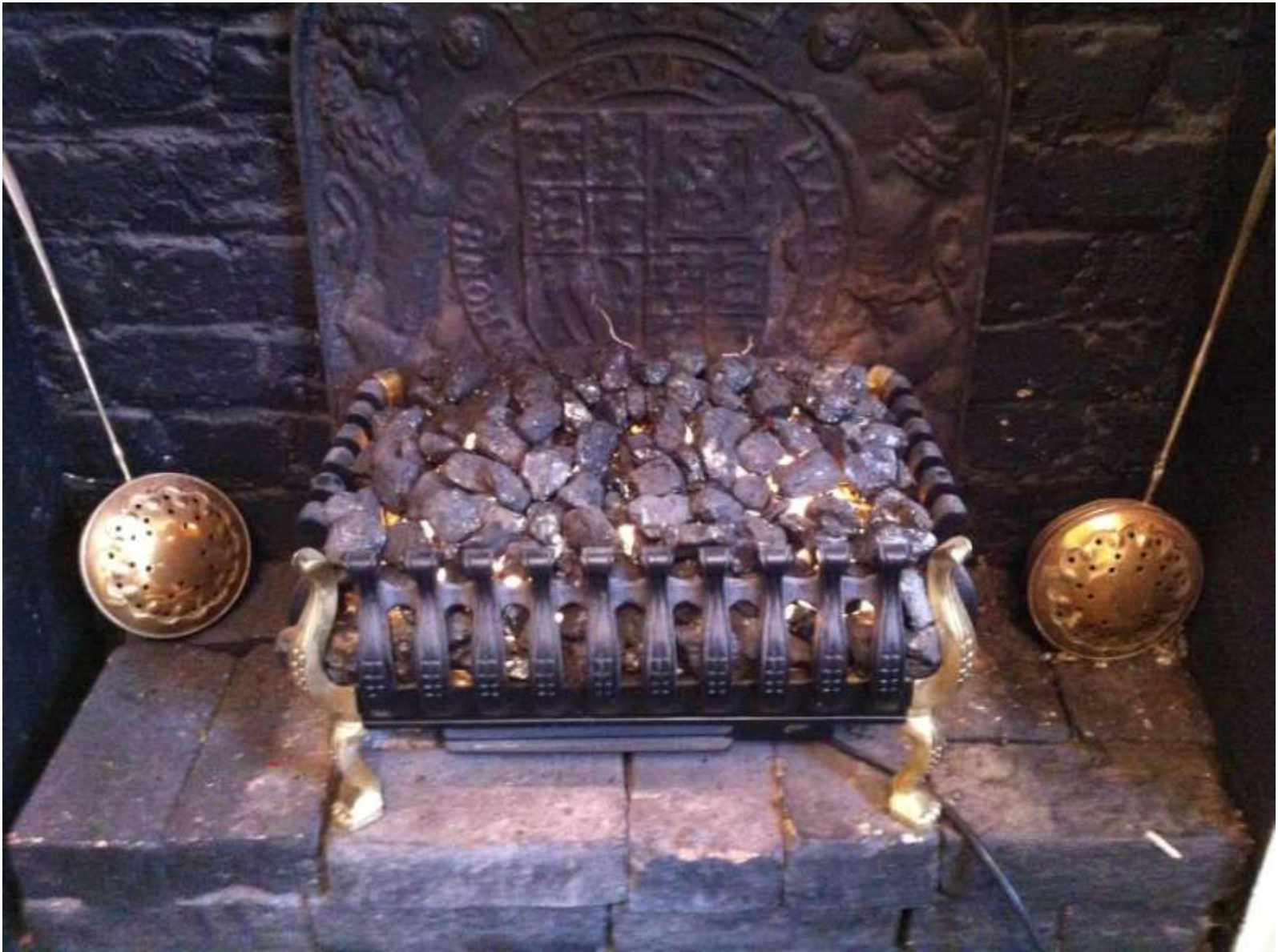
Original electric bulb & fan heater fire, nice cast aluminium & brass grate