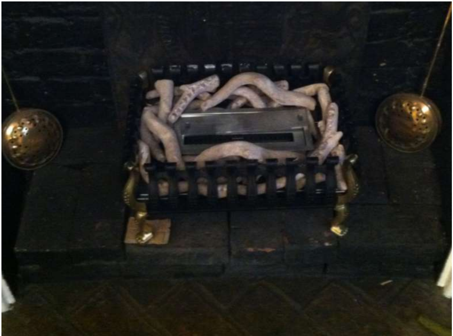
Arrange ceramic driftwood logs around burner