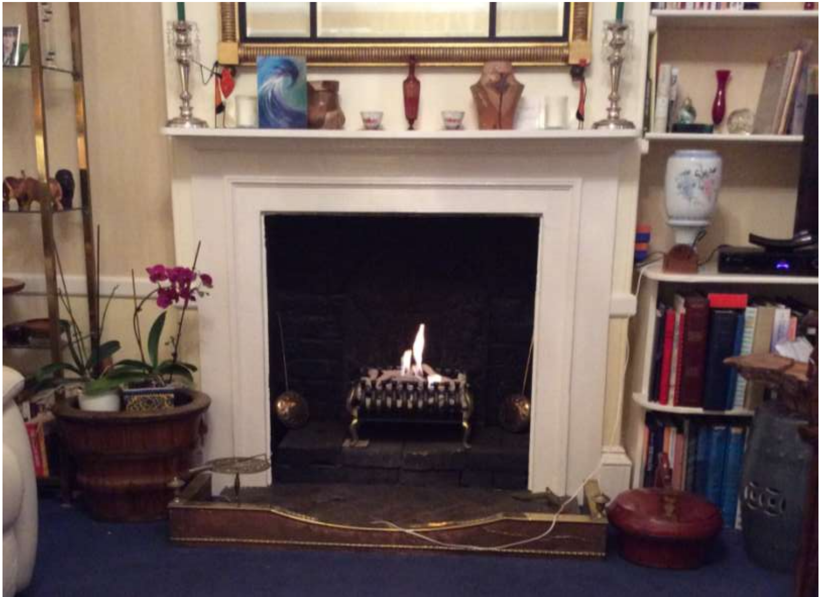
Bio fire burning in fireplace