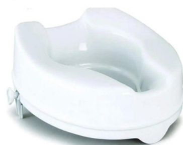
COMMUNE SEAT HEIGHT RAISER