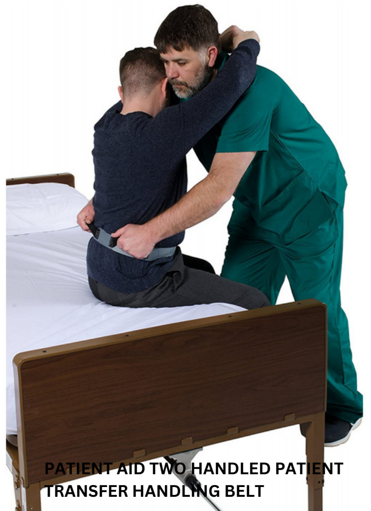
PATIENT AID TWO HANDED PATIENT TRANSFER HANDLING BELT