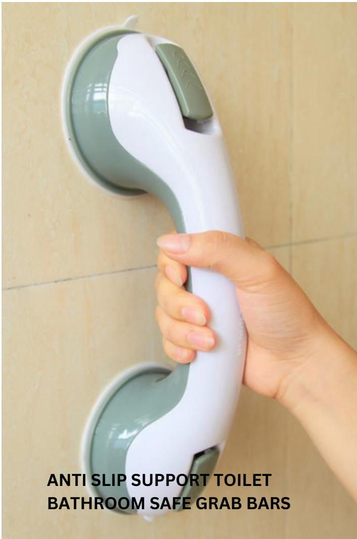
ANTI SLIP SUPPORT TOILET BATHROOM SAFE GRAB BARS