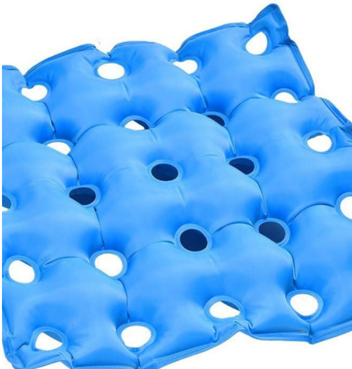
WHEELCHAIR CUSHIONS FOR PRESSURE SORES FOR SITTING