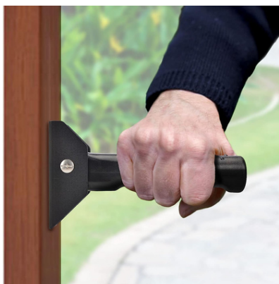
DOORWAY FLIP ASSIST HANDLE