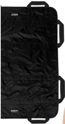
BED POSITIONING PAD WITH REINFORCED HANDLES