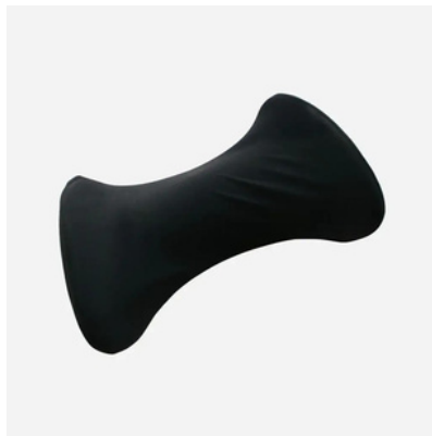
PRAEGNACY SUPPORT PILLOW