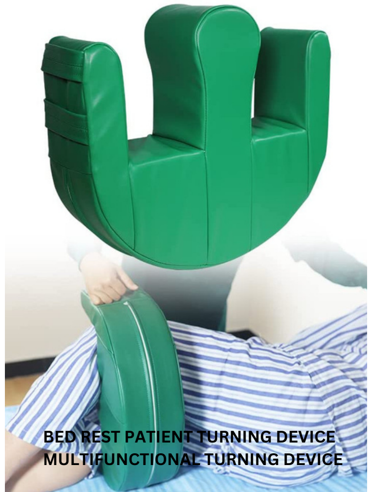
BED REST PATIENT TURNING DEVICE MULTIFUNCTIONAL TURNING DEVICE