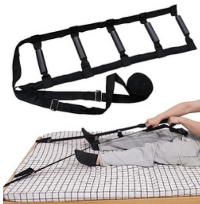
BED LADDER ASSIST 160 INCH