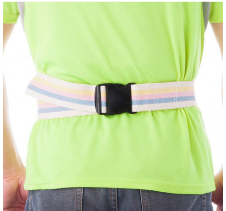
GAIT BELT 60INCH - TRANSFER AND WALKING ASSISTANCE WITH QUICK RELEASE BUCKLE