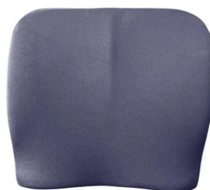
MEMORY FOAM BACK SUPPORT