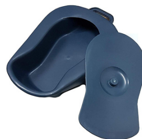
BED SIDE PANS