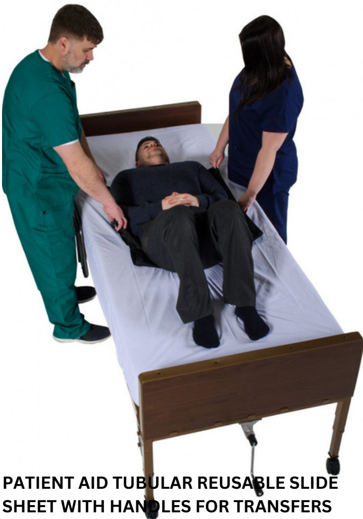
PATIENT AID TUBULAR REUSABLE SLIDE SHEET WITH HANDLES FOR TRANSFERS