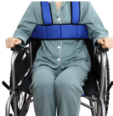
WHEELCHAIR SAFETY BELT TORSO SUPPORT VEST