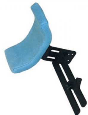
NECKREST SUPPORT FOR WHEELCHAIR