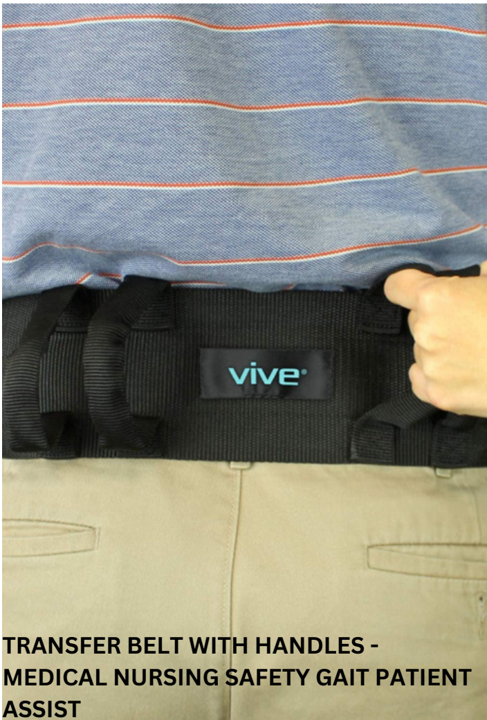
TRANSFER BELT WITH HANDLES - MEDICAL NURSING SAFETY GAIT PATIENT ASSIST