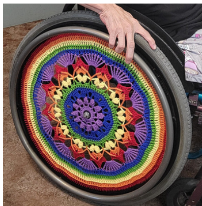
WHEELCHAIR RIM DECOR