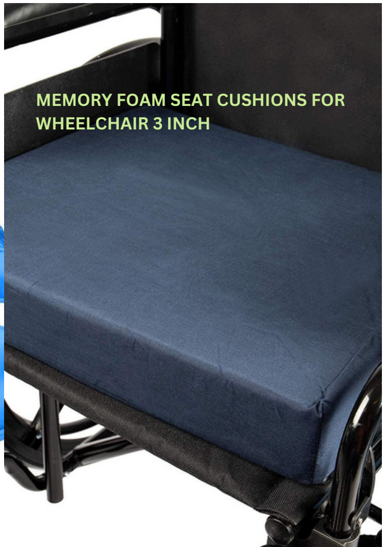
MEMORY FOAM SEAT CUSHIONS FOR WHEELCHAIR 3 INCH