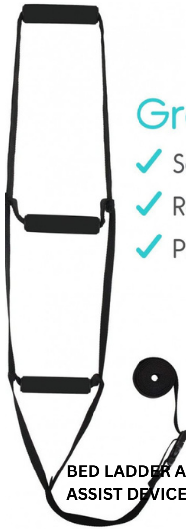
BED LADDER ASSIST - PULL UP ASSIST DEVICE WITH HANDLE STRAP