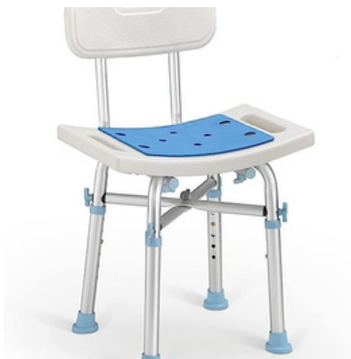
PREMIUM BATH STOOL