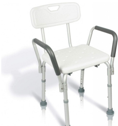
BATH CHAIR HEIGHT ADJUSTABLE