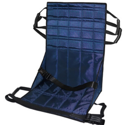
LIFT STAIR SLIDE BOARD TRANSFER