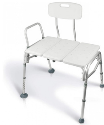
EXTRA WIDE BATH CHAIR WITH HANDLES