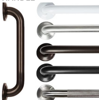
GRAB BAR FOR BATHTUBS AND SHOWERS