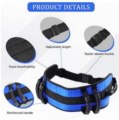
GAIT BELT WITH 6 HANDLES