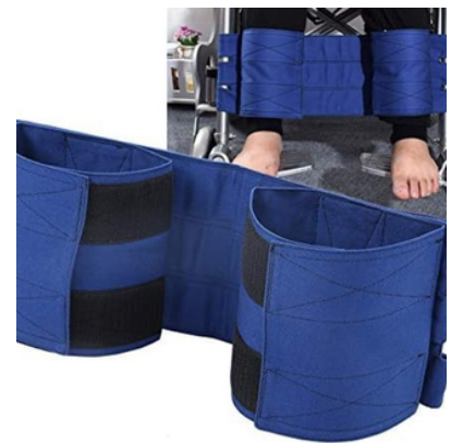
WHEELCHAIRE FOOT SUPPORT