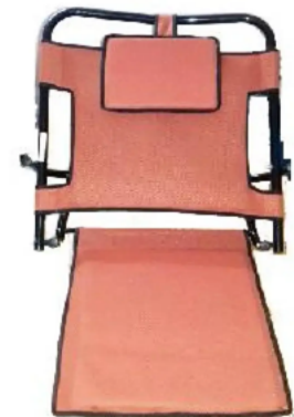
BACK REST SUPPORT