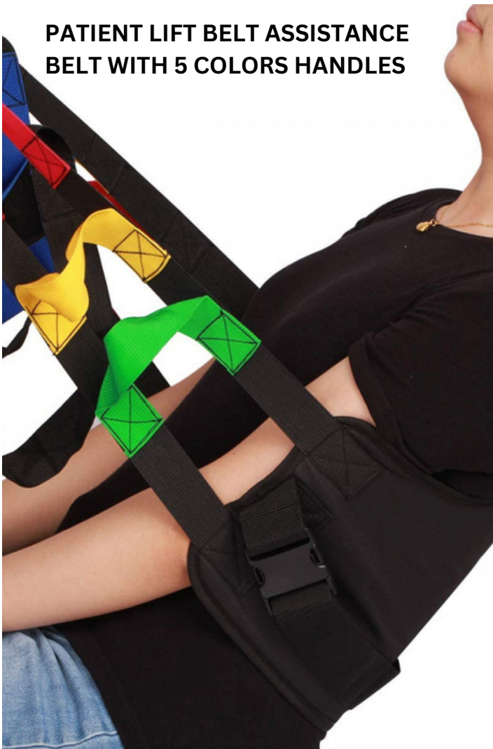
PATIENT LIFT BELT ASSISTANCE BELT WITH 5 COLORS HANDLES