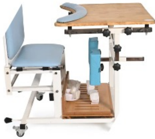
SEATING & STANDING