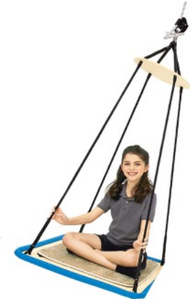
ACTIVITY & THERAPY