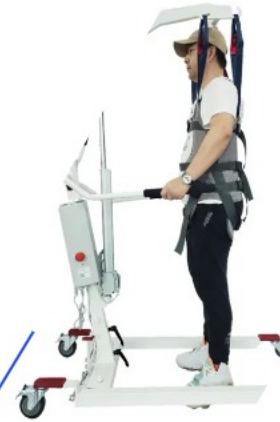
LIFTING & TRANSFER