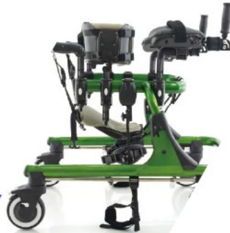
MOBILITY & WALKING