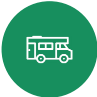
Mobile Home & RV