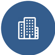
Condo & Apartment