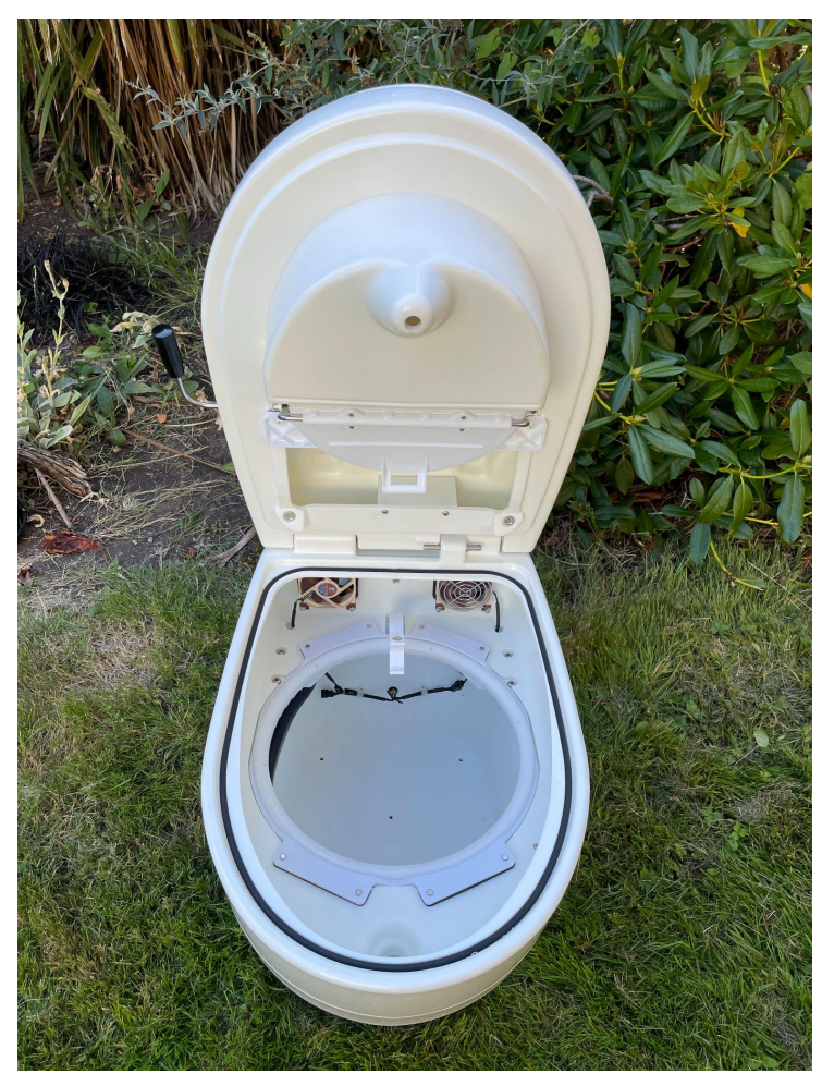
Toilet seat open