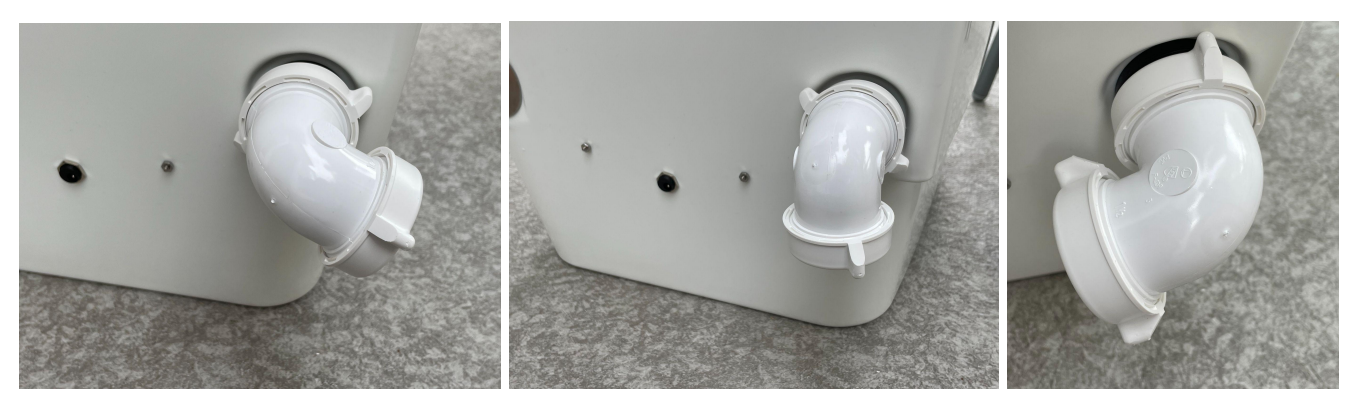
The drain fitting elbow can be directed left, right, or straight down. To go straight back use the straight drain fitting supplied. (Shown below).