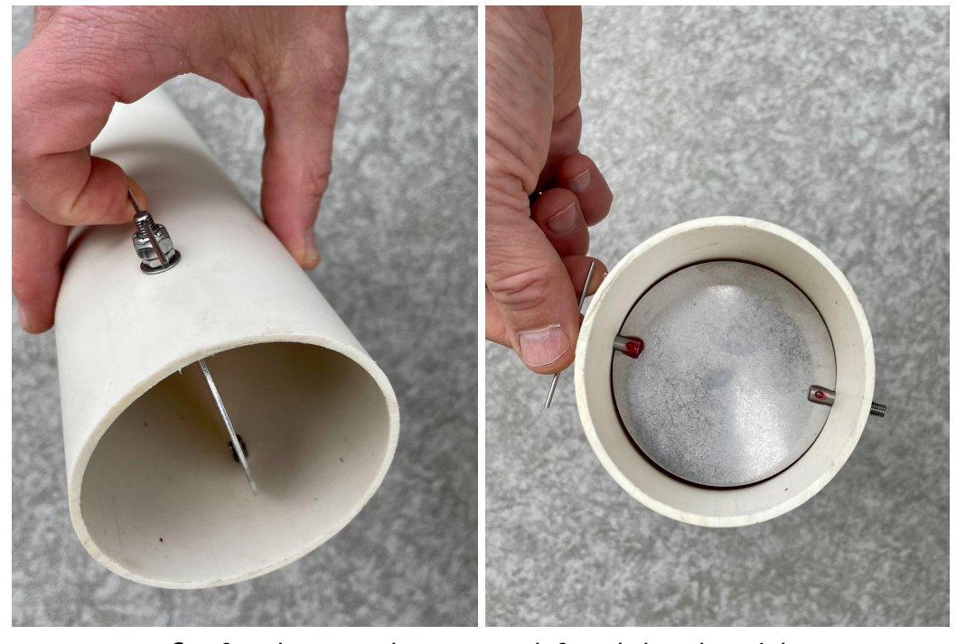
Comfort damper valve open on left and closed on right