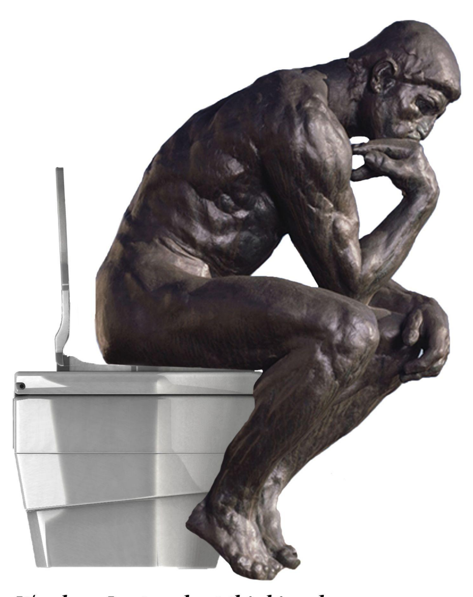
It's where I get my best thinking done

Electrical connection: 3-foot/1-meter adaptor with 120 volt plug; 3-foot/1-meter 12 volt power cable.