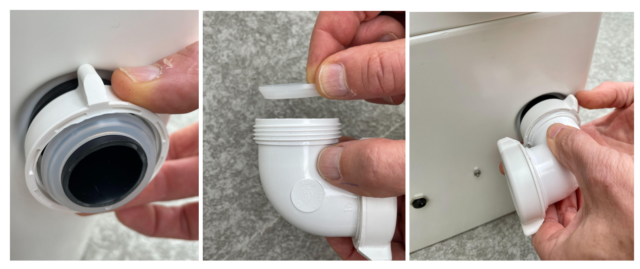
Note the orientation of the washer. The bevel goes towards the threads. The washer may be white or black. No teflon tape is needed.

These are standard friction fit plumbing connections. You should tighten them very tightly by hand . Do not use a pipe wrench. You may tighten a little more (maybe ¼ turn) using slip joint pliers or a slip nut wrench. If uncertain, watch videos online on how to do it. It's easy.