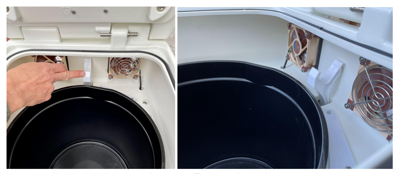
Here the trap door arm is shown open. There is no bag in the container for clarity.

3) Push the trap door arm backwards, out of the way, as shown below. It will engage with a magnet at the back of the toilet. The waste container can now be removed.