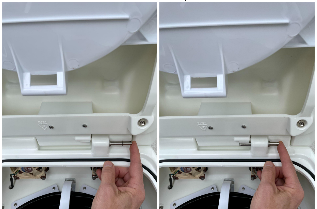
Hold the seat open with the latch pin as shown