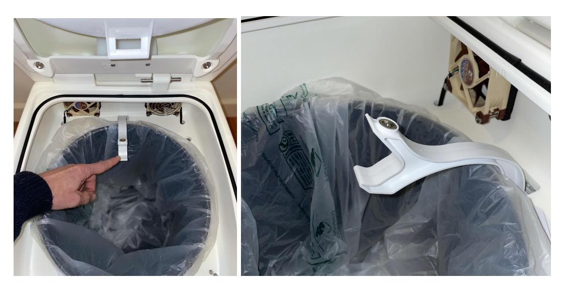
Here the trap door arm is shown over the waste container