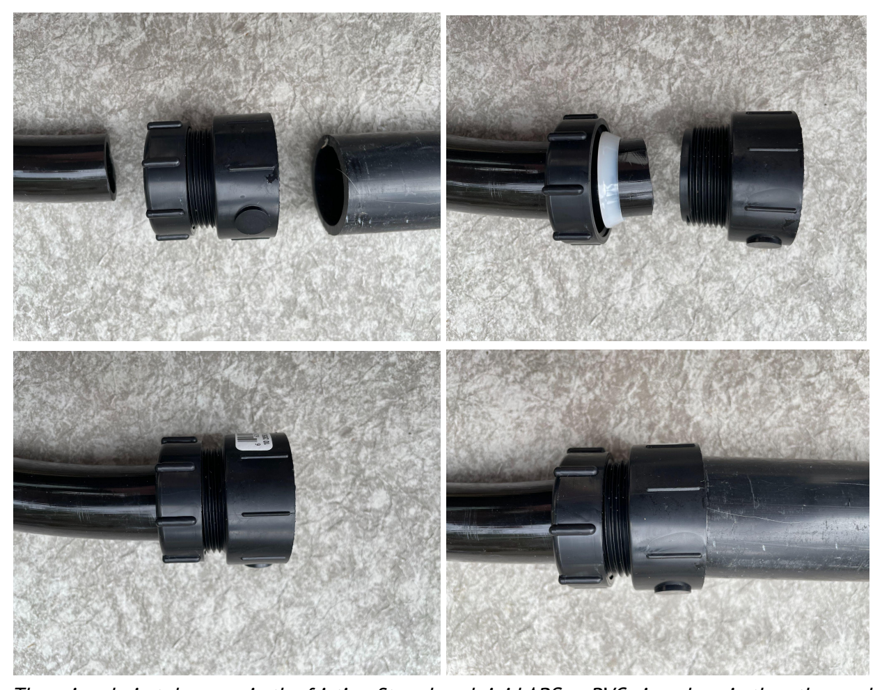
The urine drain tube goes in the friction fit end, and rigid ABS or PVC pipe glues in the other end.

The flexible drain line attaches to the fitting in exactly the same way. If you need to extend the urine drain line beyond 5 feet, transition to a 1.50 inch (or 1.25") PVC or ABS pipe. An 1.5" adapter is supplied. This is a friction fit on the hose side, and a glue joint on the pipe side. It is an ABS fitting. You'll need to purchase the correct glue. (ABS glue - if you are connecting ABS pipe, or ABS to PVC glue - if you are connecting PVC pipe).