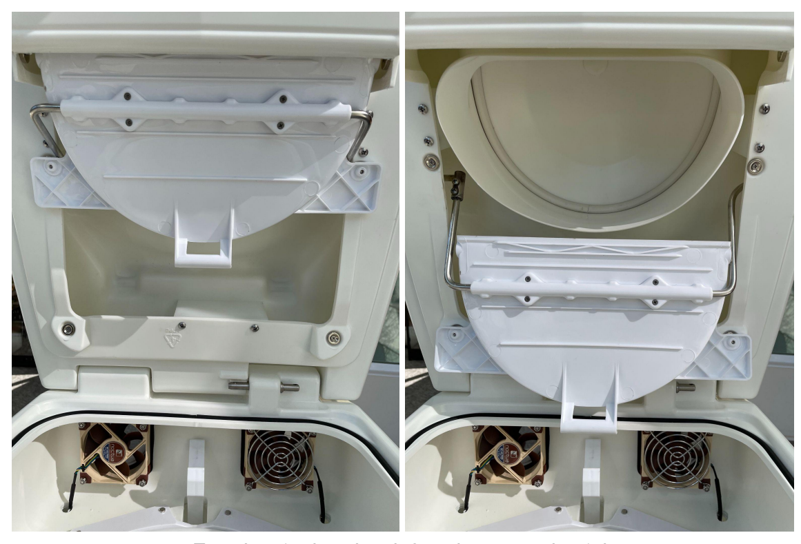
Trap door is closed on left and open on the right

3) IMPORTANT - Ensure the trap door is in the closed position. If it is not, gently move the trap door to the closed position as shown below on the left. The trap door is shown open on the right.