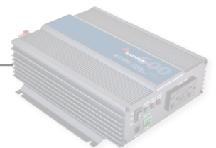
Inverter / DC Load

NOTE: Please refer to the manual for detailed installation instructions.