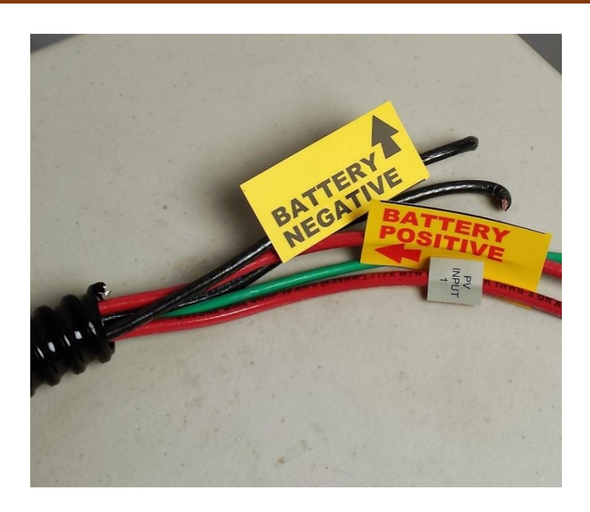
Marking your wires is ALWAYS a good idea