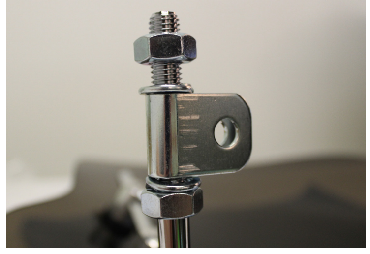
Step 4: Assemble end of the strut