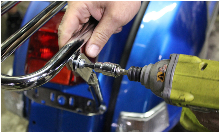
Step 7: Tighten all hardware