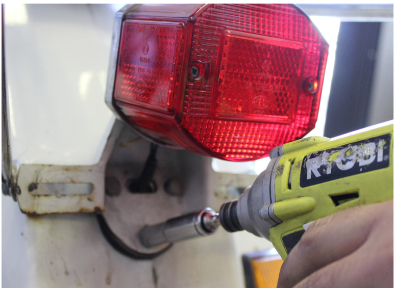
Step 9: Attach tail light and tighten all hardware

Step 10: Enjoy your new Prima BBQ Rear Rack and contact us with any inquiries.