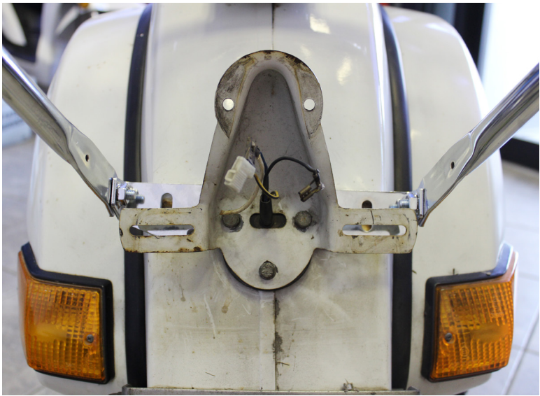
Step 8: Attach tail light mount