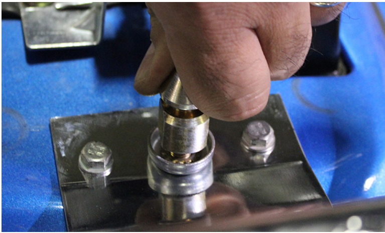
Step 6: Attach underseat hardware