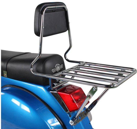
Step 8: Enjoy your new Prima BBQ Rear Rack