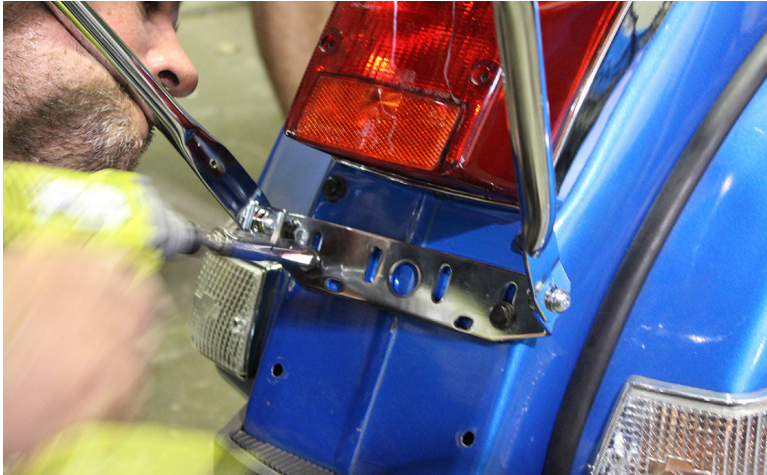
Step 7: Attach hardware on lower bracket