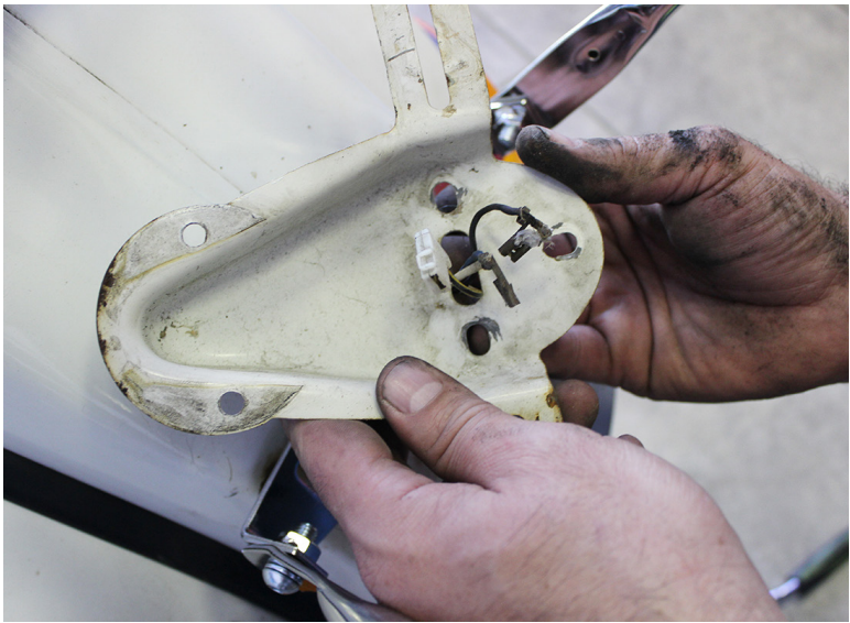
Step 7: Feed Electrical through tail light mount