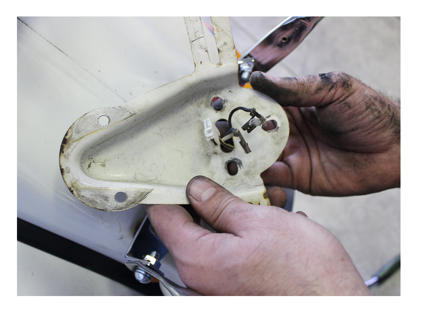
Step 8: Attach tail light mount