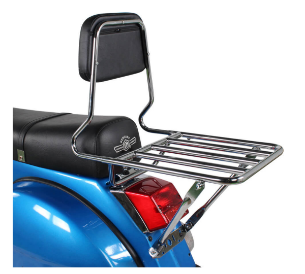
Step 8: Enjoy your new Prima BBQ Rear Rack