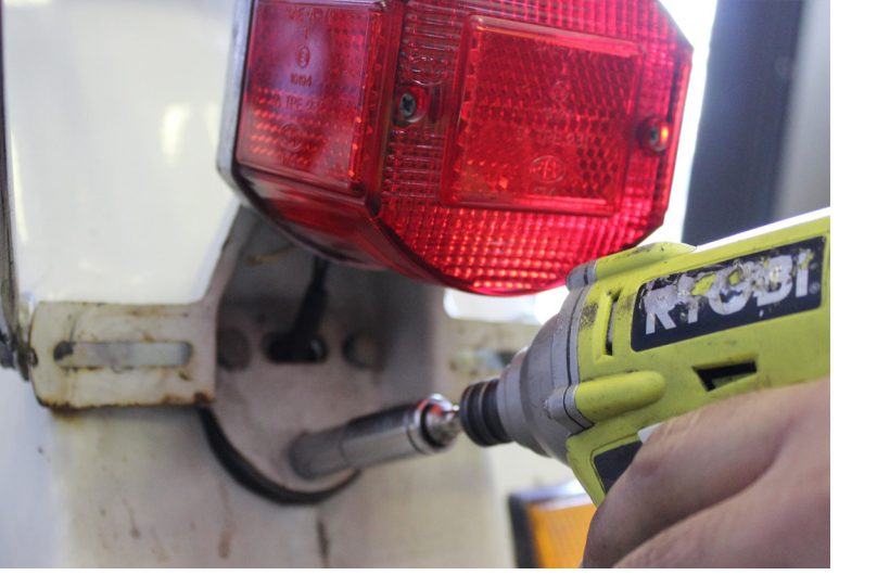
Step 9: Attach tail light and tighten all hardware

Step 7: Feed Electrical through tail light mount