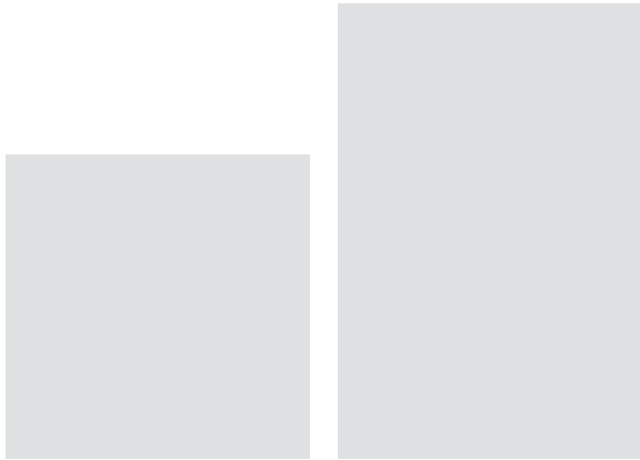
570 X 570